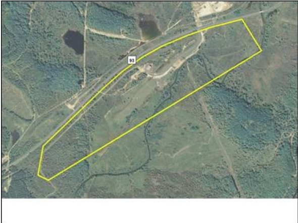
Tucker County Industrial Park.jpg