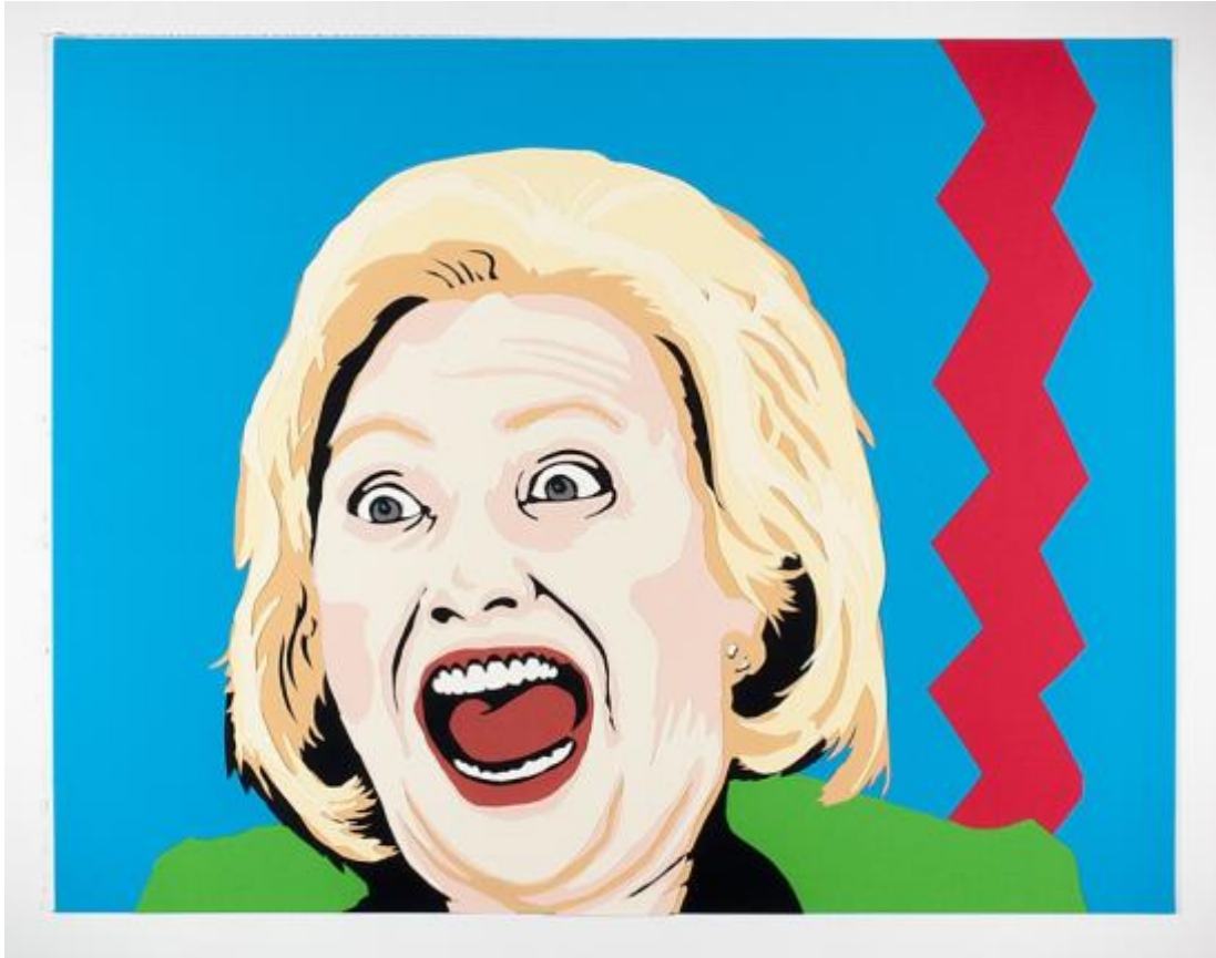
The Holy Trinity of Iconic Laughters - Nasty Hillary, 2017 cut-paper collage 17 ½ x 22 ½ in. [44.5 x 57.2 cms] $1,500