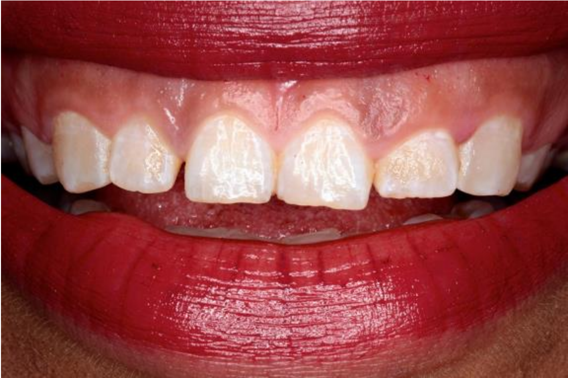
Smile , 2010 archival inkjet print