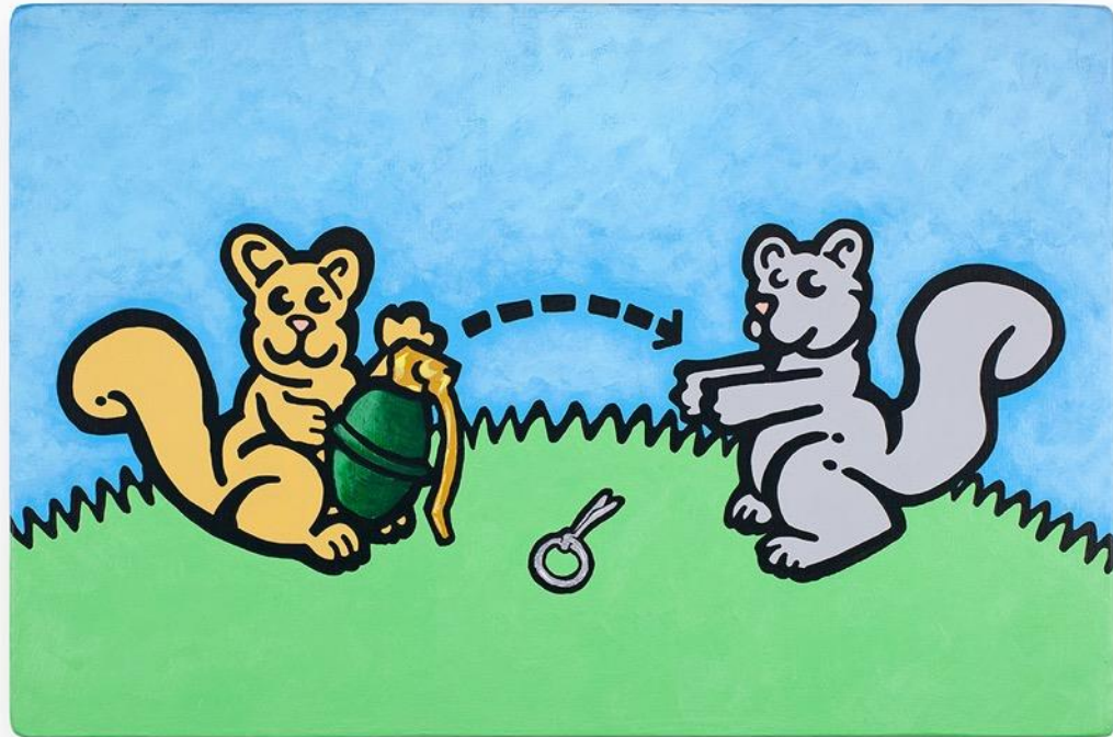
Squirrels At Play Redux, 2017 relief sculpture 16 x 24 x 1 ¾ in. [40.6 x 61 x 4.4 cms] $1,750