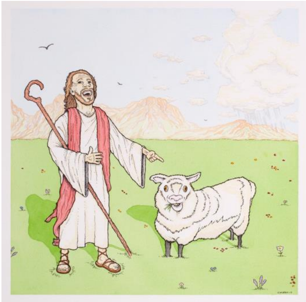
The Big Picture, 2017 watercolor 33 x 34 (10 x 10 art) in. [83.8 x 86.4 (25.4 x 25.4 art) cms] $1,500