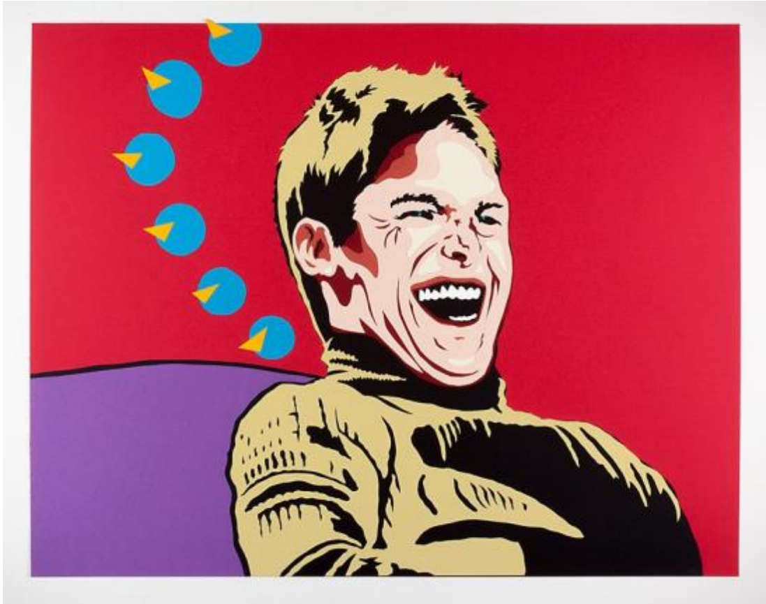
The Holy Trinity of Iconic Laughters - Impossible Tom, 2017 cut-paper collage 17 ½ x 22 ½ in. [44.5 x 57.2 cms] $1,500