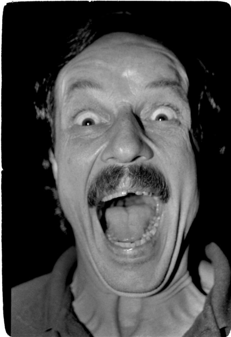
Laugh Track , 1996 archival inkjet print

72 x 48 in. [182.9 x 121.9 cms] Edition of 3 1 st edition & Exhibition Print - $6,000 2 nd edition - $8,000 3 rd edition - $10,000