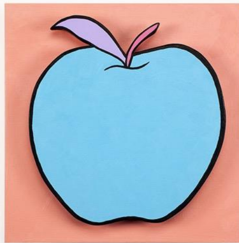
One Bad Apple Revisted , 2017 relief sculpture 12 ½ x 12 ½ (each x 4) [32 x 32 cms] $2,750 NFS to Andrew Johnson