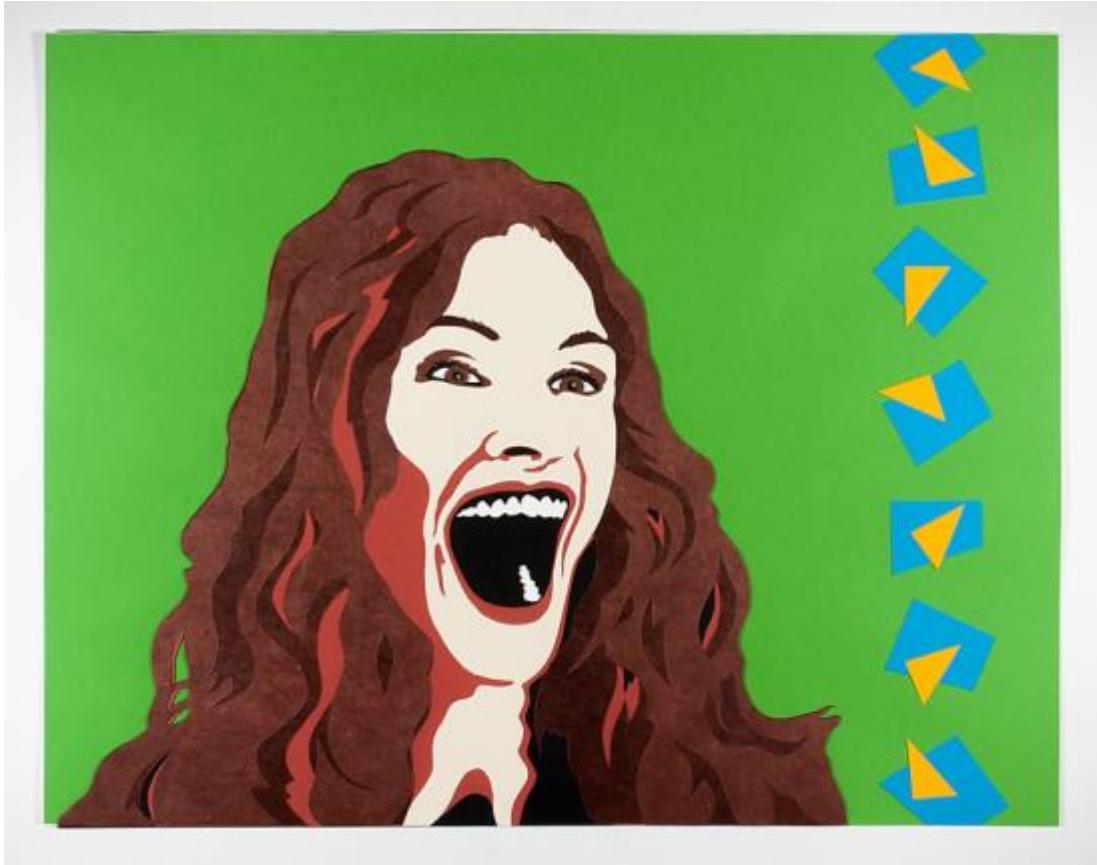
The Holy Trinity of Iconic Laughters - Pretty Julia, 2017 cut-paper collage 17 ½ x 22 ½ in. [44.5 x 57.2 cms] $1,500