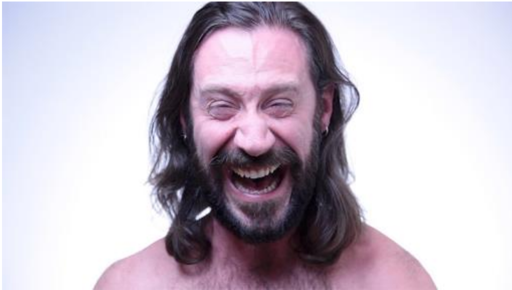
Laugh Track (video), 2017 digital video (Edition of 5) 1080p Full HD $4,000