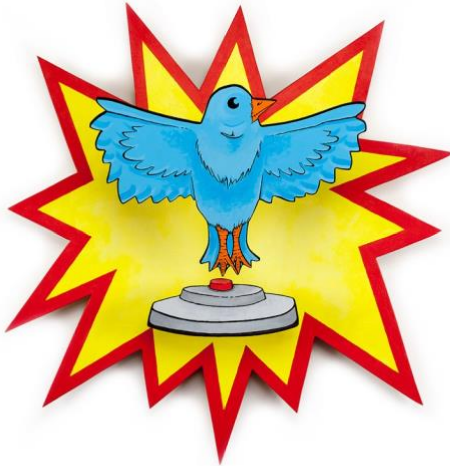
Tweet Tweet Boom, 2017 relief sculpture 24 x 23 ½ x 6 ½ in. [61 x 59.7 x 16.5 cms] $1,750