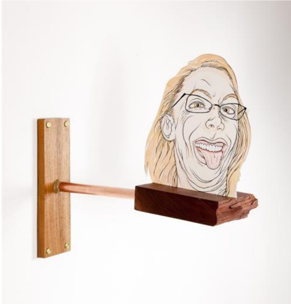
Still Jenny On The Block, 2017 teak, mahogany, copper, brass, twine, watercolor and ink 17 x 19 ¼ x 5 ½ in. [43.2 x 48.9 x 14 cms] $1,750