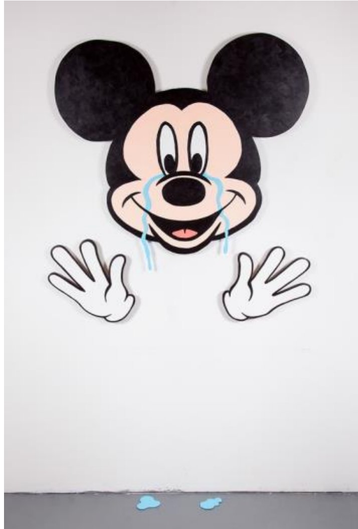
Mouse Droppings, 2017 relief sculpture 48 x 50 x 1 ¼ in. [121.9 x 127 x 3.2 cms] $2,250