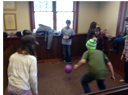
Religious school not only teaches our students about Hebrew and Judaism, they also enjoy the time together to bond through fun and games.