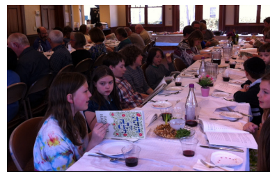
Passover Seder 2014

Located at the corner of Waukazoo & Michigan or on the web at: www.templebnaiisraelofpetoskey.org