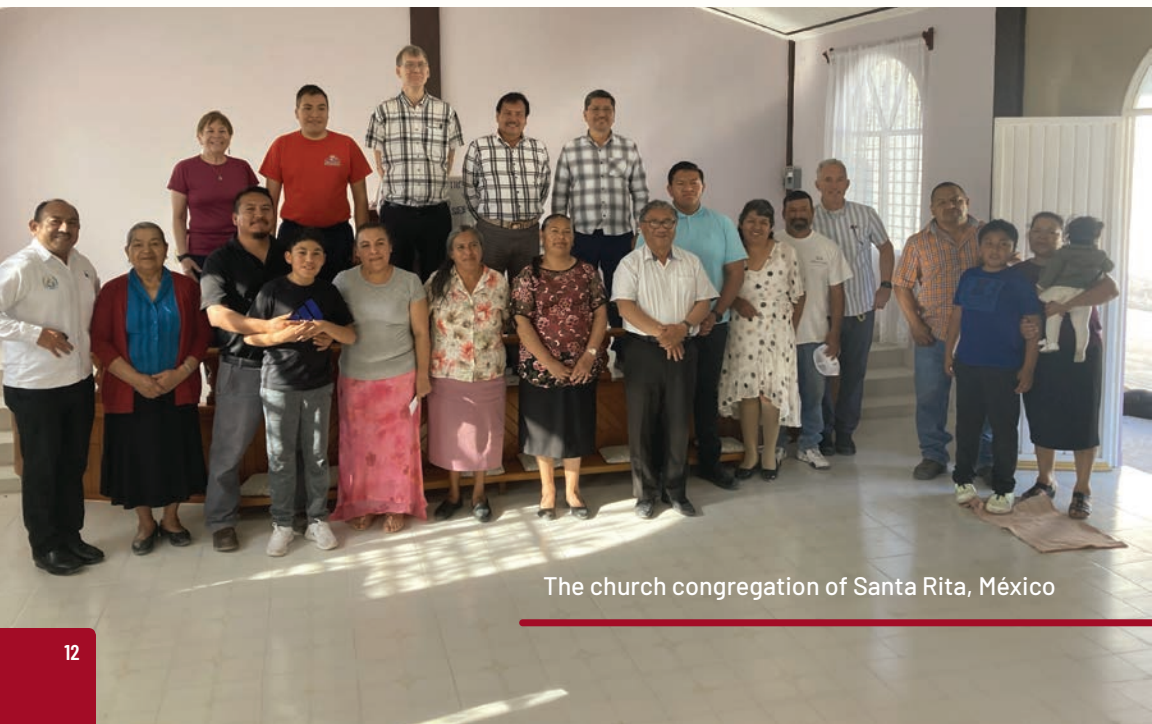
The church congregation of Santa Rita, México

Later during our trip, we flew south to the heart of the Mayan world in the Yucatán Peninsula. We met with the Presbytery of Sac Be in the colonial town of Izamal. This presbytery has a vision to revitalize churches in the area. The Outreach Foundation is excited about partnering with this presbytery to hire a pastor for the church in Izamal that has been without one for an extended period.