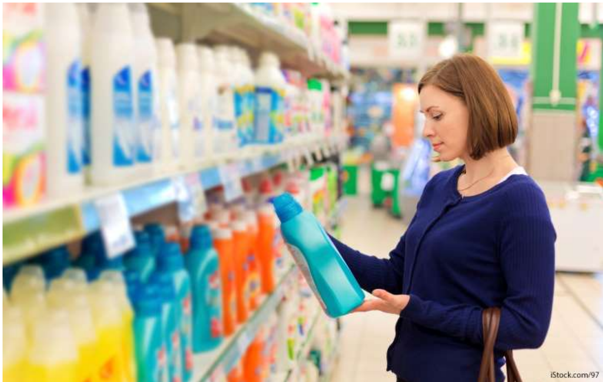
buy duplicates items

If you can't keep track of the items you own due to clutter, there's a good chance you'll repurchase products you already have in stock.