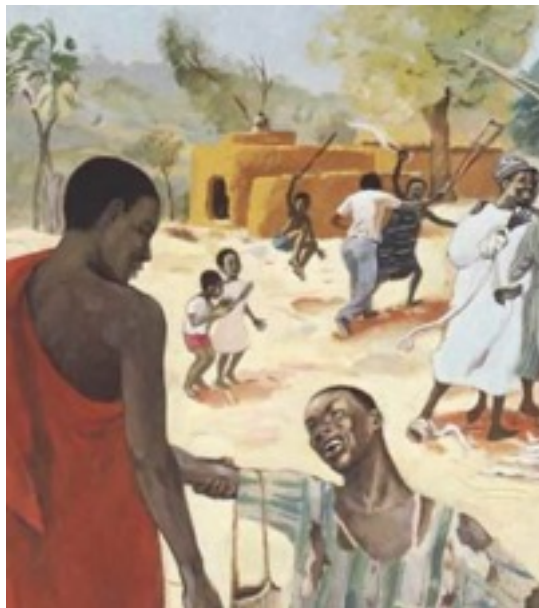
Image: JESUS MAFA, Cameroon, Africa, 1973 Healing of the Ten Lepers, from Art in the Christian Tradition, a project of the Vanderbilt Divinity Library, Nashville, TN.

A warm welcome to everyone please stay and enjoy hospitality after the service.