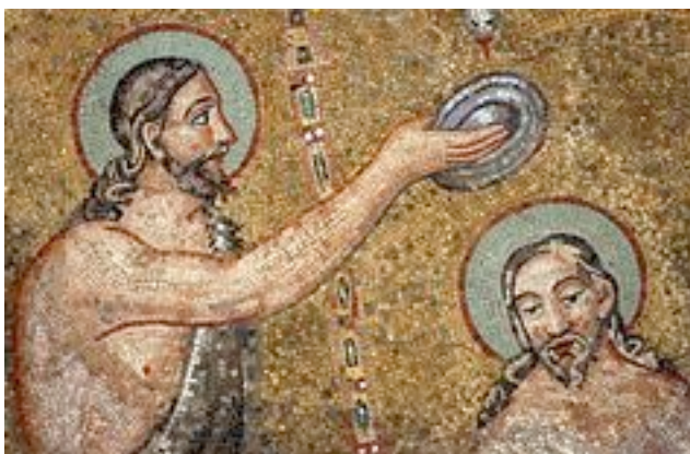
The Baptism of our Lord, Battistero Neoniano, Ravenna, Italy

© 2000 by Carolyn Winfrey Gillette. All rights reserved.