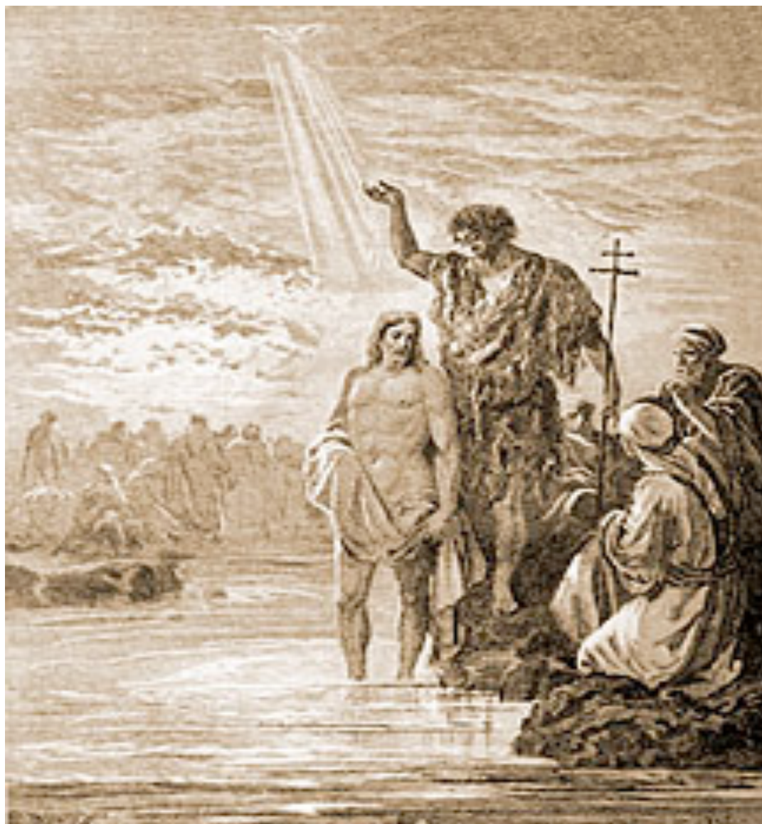
Baptism of Jesus Gustave Doré, 1866.