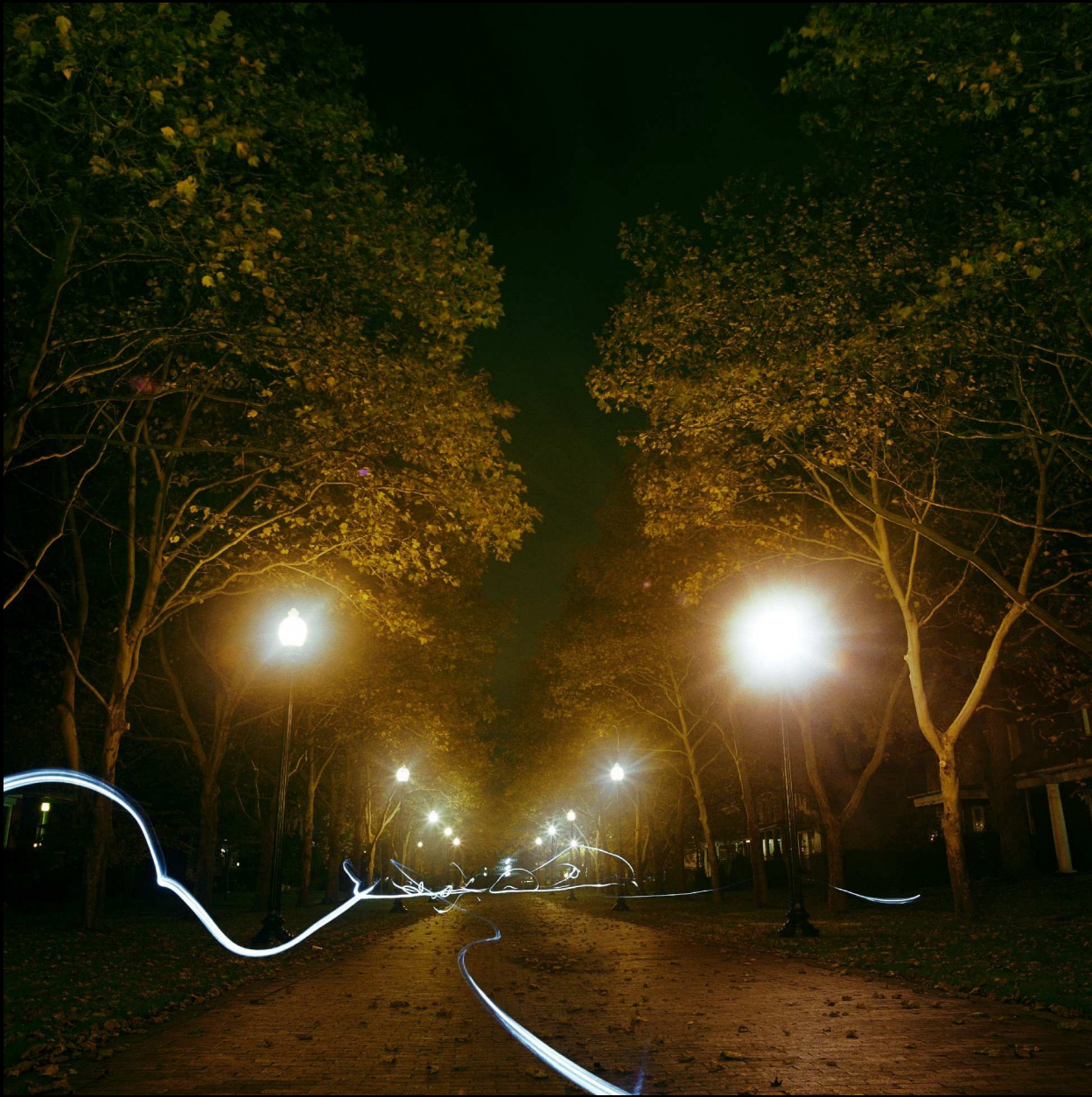
Dark Skate Detroit / Pallister Street, 2010 c-print 48 x 48 inches