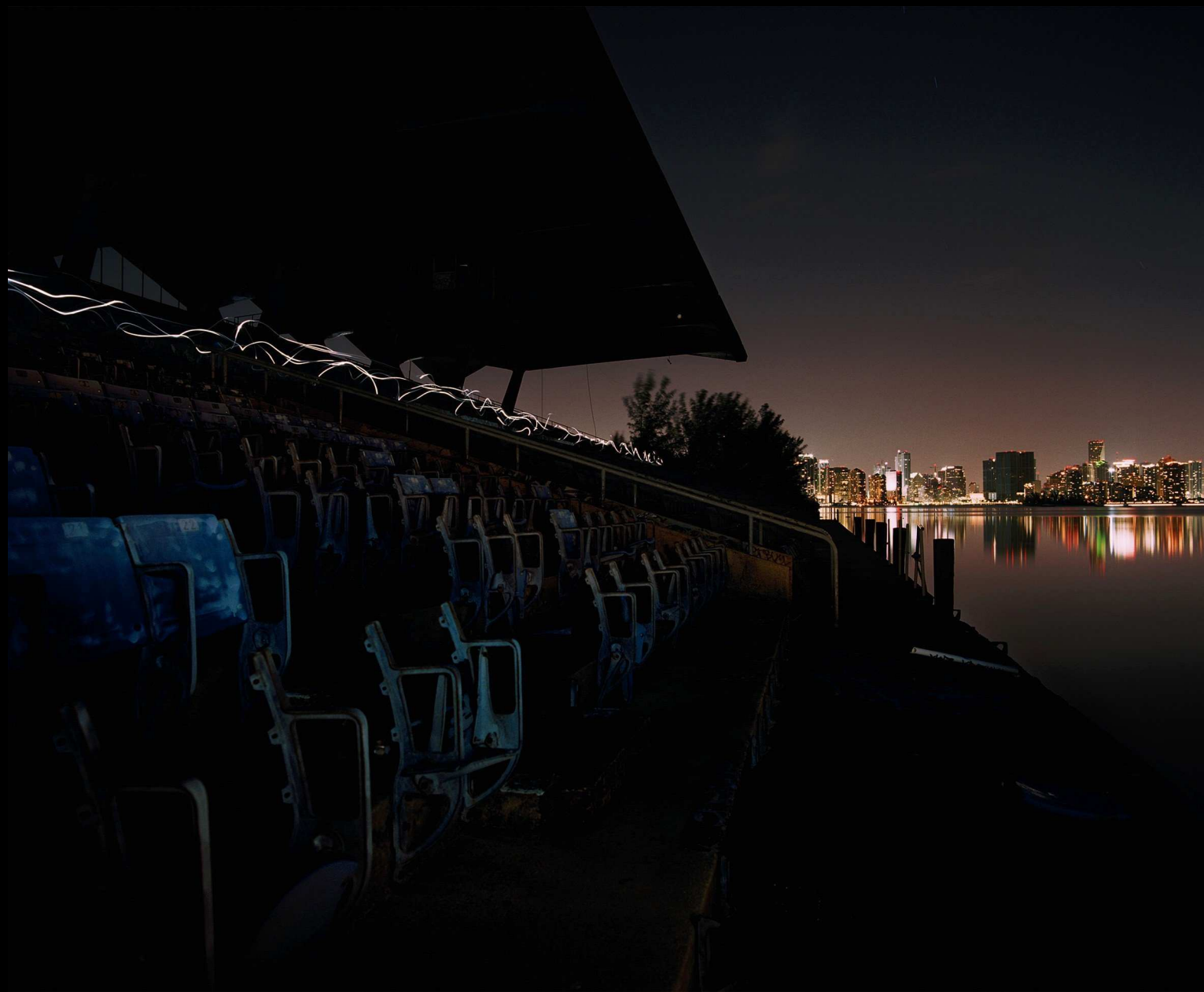
Dark Skate Miami / Stadium Seating, 2008 c-print 24 x 30 inches