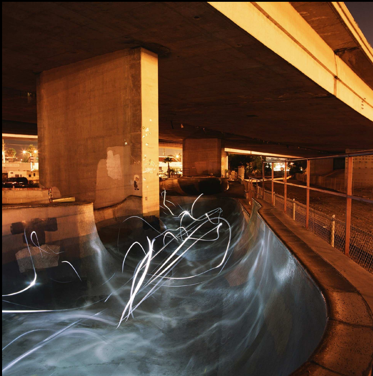
Dark Skate Los Angeles / San Pedro Self-Built, 2008 c-print 48 x 48 inches