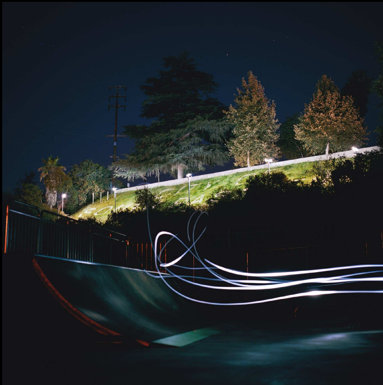
Dark Skate Los Angeles / Pasadena Hill, 2007 c-print 48 x 48 inches