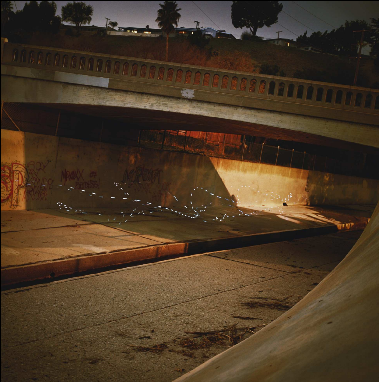
Dark Skate Los Angeles / Broken Line, 2007 c-print 12 x 12 inches