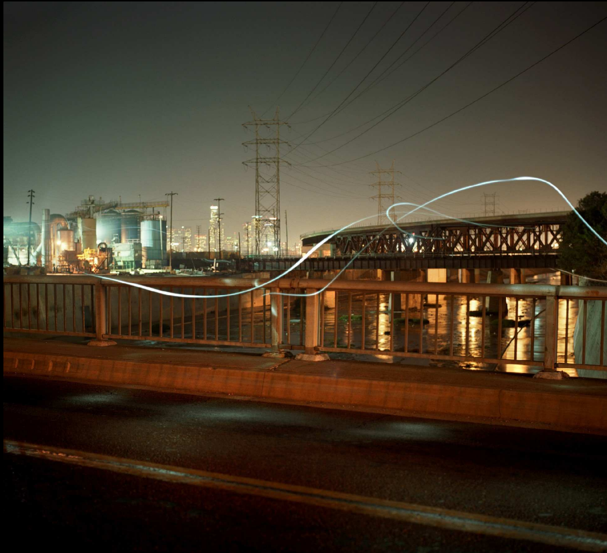
Dark Skate Los Angeles / Downtown, 2007 c-print 48 x 48 inches