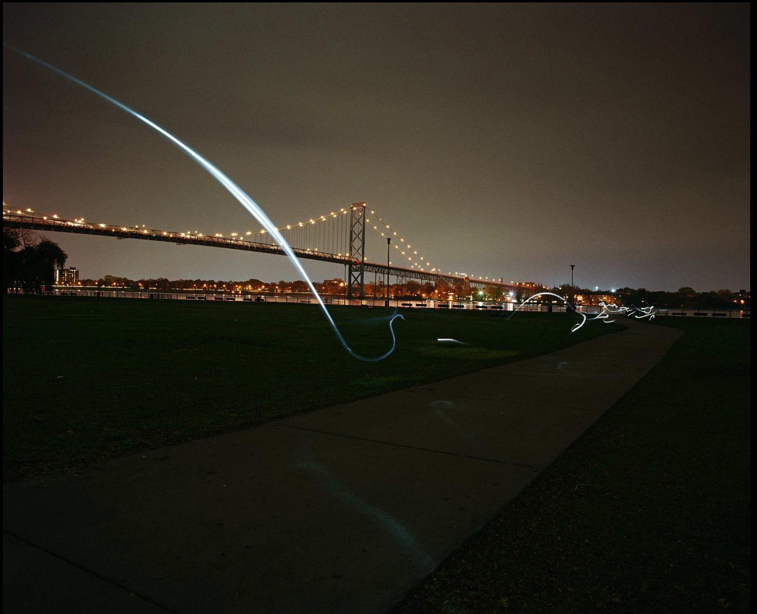
Dark Skate Detroit / Bridge to Canada, 2010 c-print 48 x 56 inches