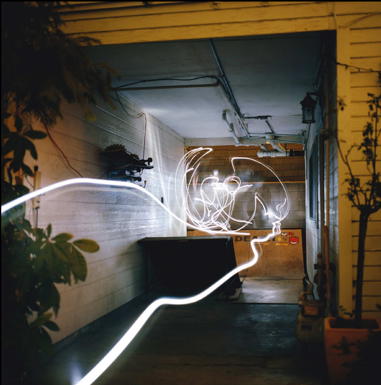
Dark Skate Los Angeles / Backyard, 2007 c-print 48 x 48 inches