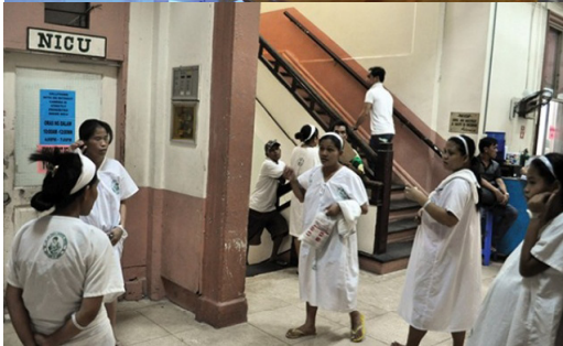
Top: Mothers who have recently received c-sections wait outside the NICU to breast feed their babies at Philippines. Bottom: A mother who has recently given birth stands to comfort her baby who receiving overhead phototherapy in Vietnam.

Throughout the field research process, we couldn't help but notice how jaundice treatment separated moms and babies during the earliest days of life. In one of the smallest rural hospitals we visited, the nurse confided that she sometimes was the only nurse for the entire hospital during the night. If a baby was receiving phototherapy in the Neonatal Intensive Care Unit, she may not have time to bring the newborn to mom to breast feed all night. Newborns need to eat every 2-3 hours and effective jaundice therapy requires both phototherapy and hydration to produce urine and stool to flush the bilirubin from the body. We saw a tremendous opportunity for technology to facilitate a new treatment context for otherwise-healthy newborns with jaundice in mom's room.