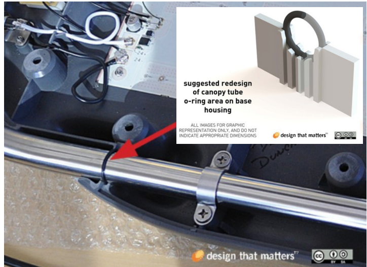
DtM used rubber o-rings to create a seal around the metal tubes where they enter the base of the device. This helps keep bugs and dust out of the device.

Instead of fans, another way to keep electronics cool is by exposing a large surface area to the air. You may have noticed cooling fins on other home electronics like your refrigerator. Metal cooling fins increase the amount of area exposed to the air and increase conduction compared to a flat, plastic outer surface. In order to completely seal Firefly, DtM designed a novel passive cooling system for the top and the bottom. The top light was easier to design because heat rises: we manufacture the top light from an aluminum extrusion that has sufficient surface area on top to enable heat from the top lights to rise upward and away from the device. The bottom light was more difficult because any rising heat could directly contribute to overheating the newborn in the bassinet. For this issue, we designed a tilted bottom surface and installed cooling fins. Because hot air rises, air from the lowest part of the device rises up along the fins, cooling the base electronics and enabling the majority of the heat to rise off the rear.