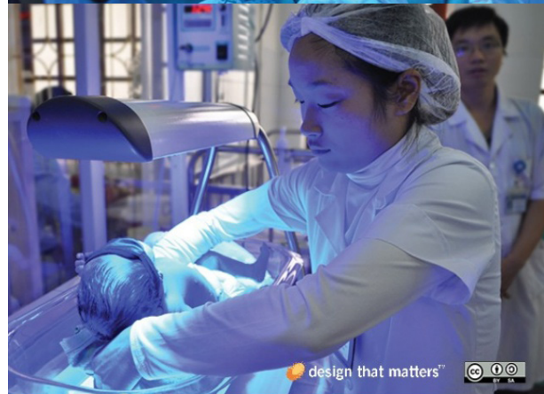
Top: Two infants share an incubator while receiving phototherapy from an overhead lamp. Bottom: A nurse places a newborn into Firefly.