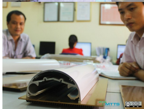
Left: The resulting top light is made of thick metal to ensure heat can escape even when draped.