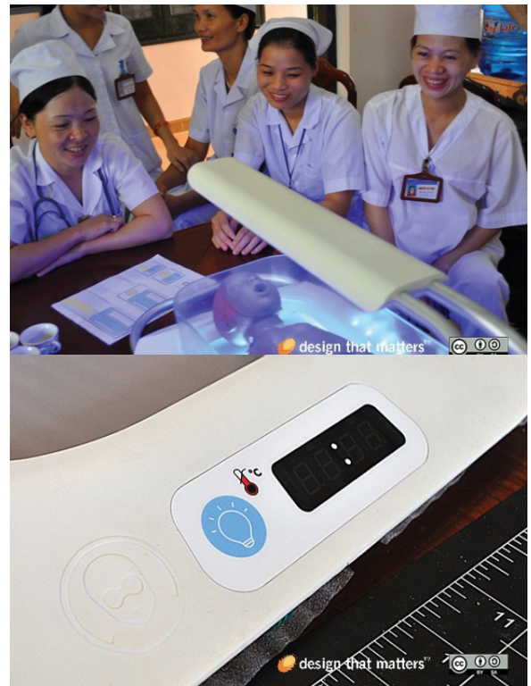
Top: Health care providers in Vietnam consider an array of different button option on paper. Bottom: The resulting simple, one-button Firefly control panel.

Result: Given that there is no known way to overdose on phototherapy, we wanted to give every baby the best chance at a successful treatment. We decided to provide one button and one power setting with both lights providing intensive phototherapy. We also excluded the white patient observation light.