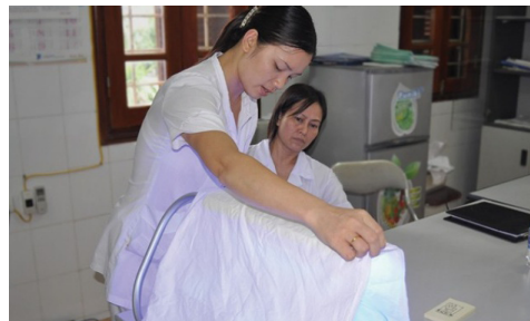
Left: A nurse uses our alpha prototype to show how she would drape Firefly to keep the light from bothering bystanders, and to keep the baby warmer.

Result: We designed the top light out of thick aluminum and mounted the electronics and lights directly onto it, drawing the heat from the electronics up and away and keeping it cool even when covered by a sheet or blanket.