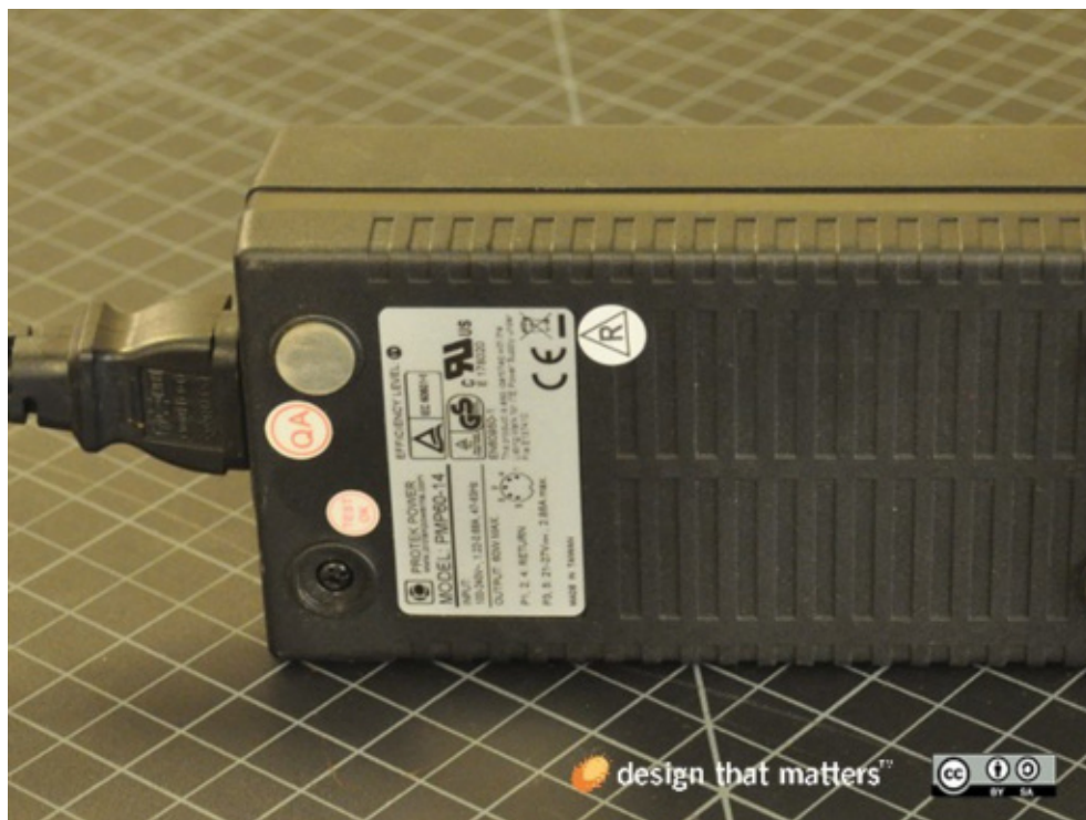
The laptop-like power supply from our Firefly clinical evaluation model prevents Firefly from burning out during a power surge, and relocates the hot power supply outside of the device and away from the baby.

Other references include the general IEC/ISO medical device standards and specific infant phototherapy standard used to design and evaluate medical electrical equipment for CE Mark and FDA Approvals. Design that Matters designed with these standards in mind, and then found where we needed to go above and beyond.