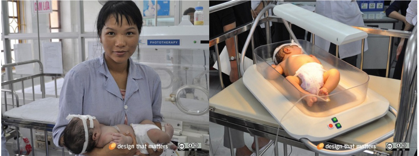
We were lucky to meet a tall mom and her above average baby early in the process so we could discover that our bassinet was too small.

Result: We went back to the drawing board, gathering statistics on typical newborn sizes, and resizing the bassinet and the entire device to fit a 90th percentile baby.