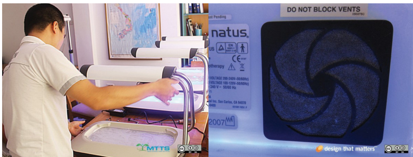
Left: Firefly manufacturer MTTs submits a series of new Firefly devices to the “burn-in test” at their offices in Vietnam. Right: The vent for the Natus NeoBlue LED Overhead Phototherapy, one of the most popular phototherapy devices used in the United States. An internal fan helps move air through this vent to cool the electronics.

Together, Thrive Networks and MTTs have over a decade of experience designing and manufacturing successful newborn health technologies for the poor. In close partnership with hundreds of hospitals in Vietnam, they discovered early on that Western devices fail due to poor training as well as environmental factors including heat, dust, and irregular electrical power. Our manufacturing and implementation partners are continually learning from hospitals, designing and releasing equipment, visiting to learn from any failures, fixing the equipment, and then redesigning the next generation of equipment to even better meet the challenges. Every piece of equipment they build also goes through a basic functionality test before it leaves MTTs. These tests have been custom designed to predict whether equipment will endure in the low resource environment. MTTs and DtM collaborated to recreate this same process for Firefly.