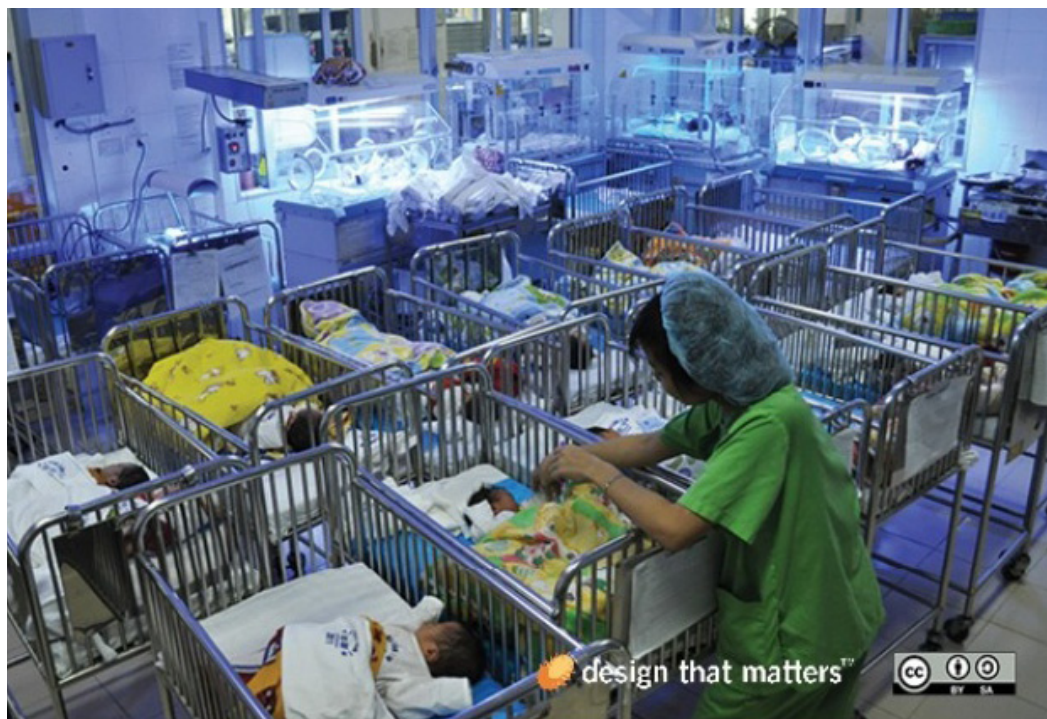
Don't be fooled by the phototherapy lamps shining from above; the four non-working incubators that sit along the walls are used as hard to clean beds for the well-baby room at a national hospital in Vietnam.

For example, take the bank of broken, high-tech newborn incubators I saw while visiting National OBGYN Hospital, Vietnam. Our extended Firefly team was preparing to treat the first patient in the nine-room Neonatal Intensive Care Unit (NICU). The Firefly room was also used to observed all newborns shortly after birth and to treat the newborns with minor health issues. I noticed many newborns in the room lying inside incubators, traditionally used to provide enclosed, warm environments for critical or intensive care and at odds with the low-intensity care needed for the room's newborns. I asked a nurse why some babies were in incubators and others in open beds. She said that they were broken incubators used simply to provide additional bed and storage space in this room. Some incubators had blown fuses due to power spikes, while others had undiagnosed failures that rendered them useless as anything but spare bedding. Many of these burnt-out devices passed FDA approval and so should therefore technically be considered effective, but there are so many ways a device can fail in a low resource setting. These incubators had become no more than fancy and cumbersome beds.