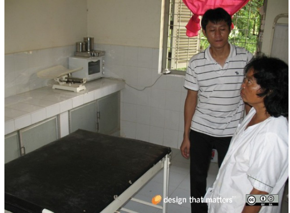
Top: One of nine rooms with 150 newborns at the Neonatal Intensive Care Unit in National OBGYN Hospital, Vietnam. Bottom: A midwife shows all the equipment she possesses at Tonlebaty, a rural clinic in Cambodia.