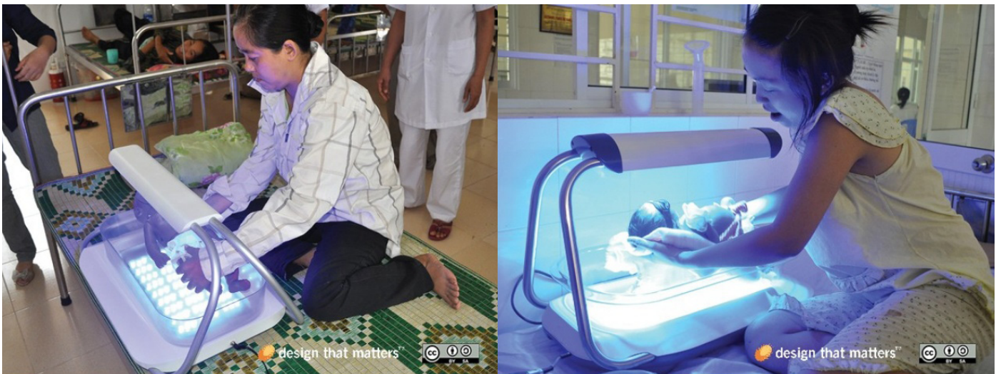
Left: A mother bumps the baby doll's head while lifting it out of the alpha prototype. Right: A mother safely and comfortably lifts her baby in and out of the final Firefly device with raised top light.

Result: We used a tape measure to simulate different light heights and had a variety of health care providers put the baby in and out until we had consensus on the right height. We adjusted the height of the top light higher in the final design.