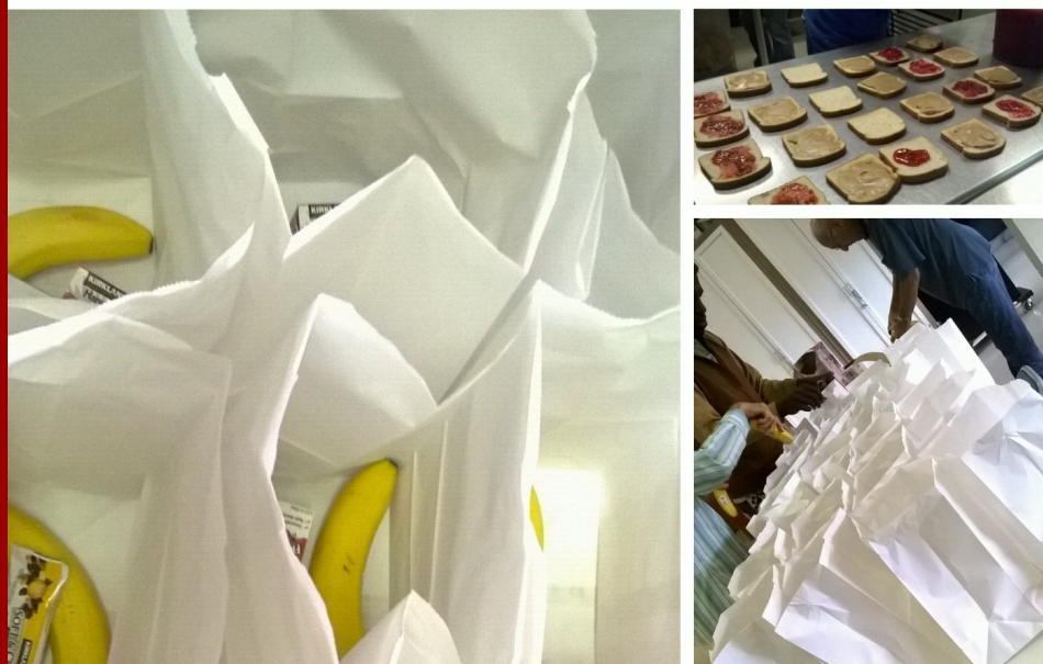
Central Oregon Veteran's Outreach Sack Lunch Preparation (delivered to camps Tuesdays)