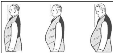
Stout Corpulent Obese