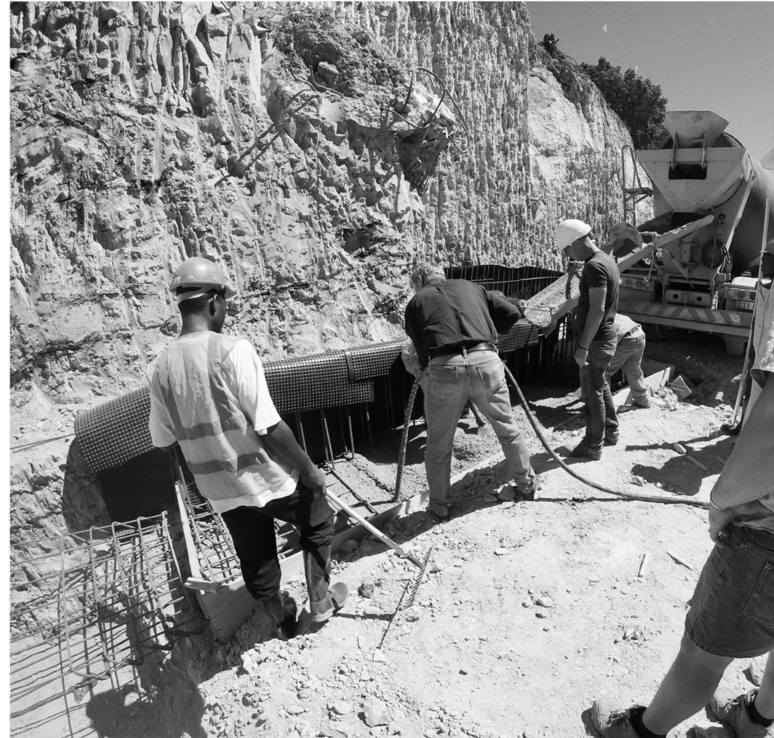
Above: A picture taken on site while laying the foundation for the Villa in Gordon's Bay.

Underground parking ensures that residents do not have to park on the street and once again reduces the visual impact in the area.