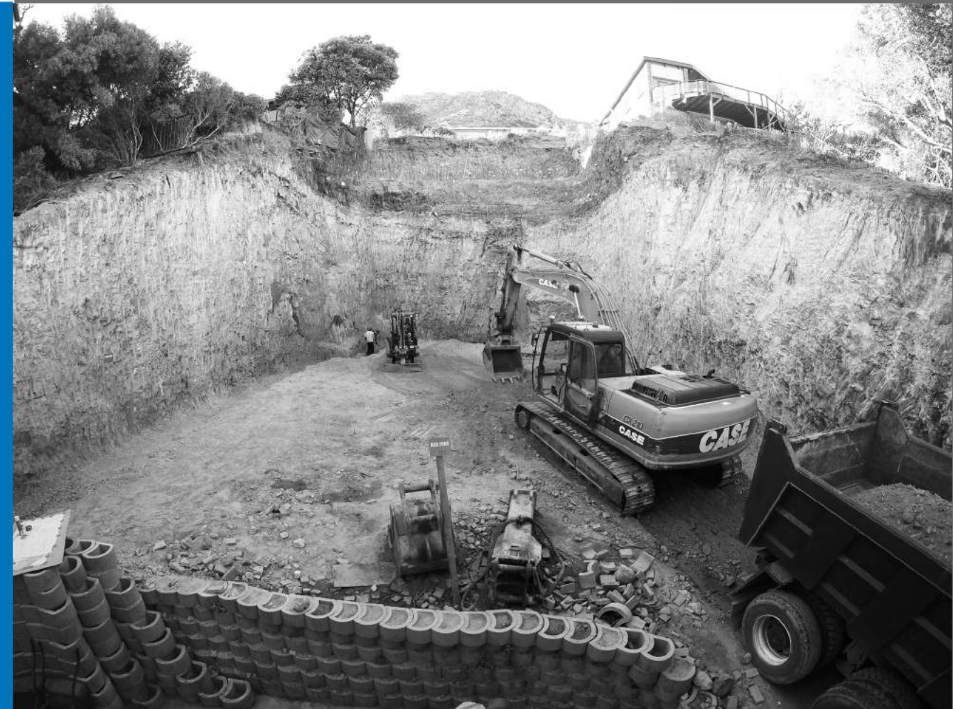
Below: Excavation at the site of the Luxury Villa in Gordon's Bay