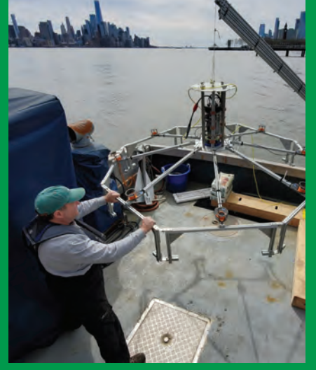
Stevens STAR Center researchers deploy a passive acoustic sensor in the Hudson River.

The new prototype improves upon the original designs while taking advantage of advances in signal processing, sound technology, hardware and software. The STAR Center team is also engineering certain components in-house to make the product lighter, smaller, and cheaper to manufacture.