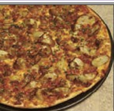
LOADED BAKED POTATO

OUR PIZZAS ARE AVAILABLE AS "TAKE & BAKE"...READY TO HEAT & SERVE!