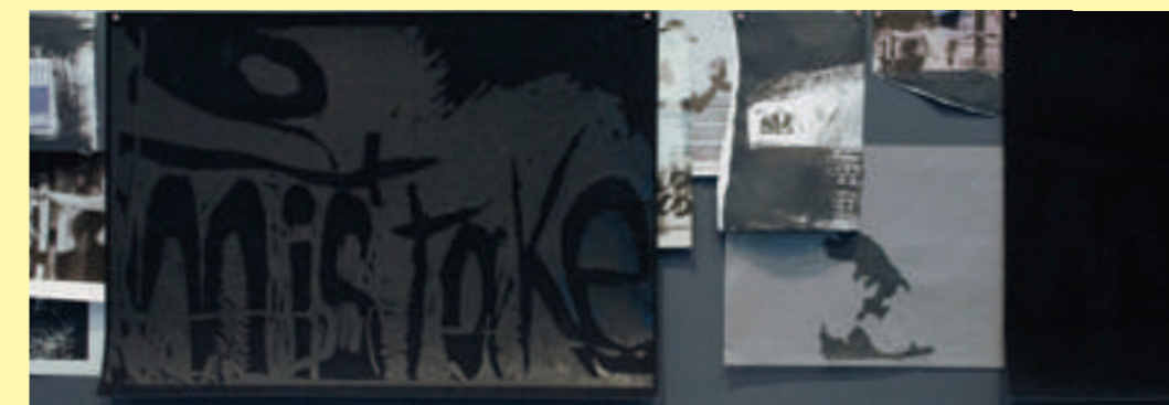
ABOVE AND LEFT: Furtive Gesture (details), 2013