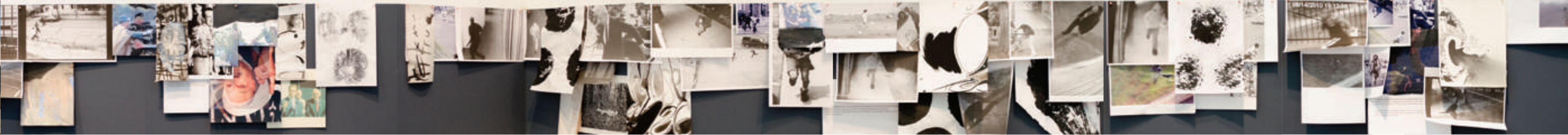
ABOVE AND FAR LEFT: Furtive Gesture (details), 2013

energy, occurs out of the combination of found elements. There's a place for gravitational pull within the frame. The framed location for a word or set of numbers can be a deep or shallow or flat space, and in some cases the space is finite, but in others it's self-aware...or the space is sliced by the edge of the frame. In the case of Furtive Gesture , it will be read in a linear fashion, so the edges of each frame have the appropriate connection (or disconnection) with one another. It's the disconnect that fires me up. I have hope that viewers will take some pleasure in "reading" the disconnections in this horizontal list or line of frames and find some humor in the form itself. Hopefully this "lineup" can offer a place to meet outside of our individual heads. Furtive Gesture has taken me into deep Internet space where people meet virtually...these are fragments that have drifted out of line.