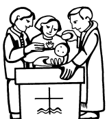
I baptize you in the name of the Father and of the Son and of the Holy Spirit

Our Heifer collection raised $440 in donations over the last few months. Thank you to the donors. We will purchase that water buffalo, a llama, and one flock of chickens with those donations. This provides families with food, income and enables the passing on of livestock to other families.