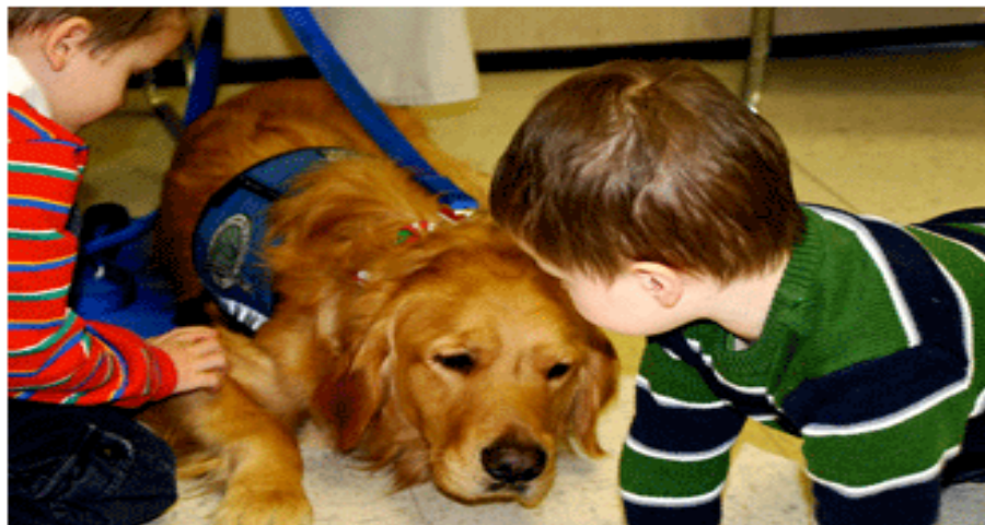
Lutheran Church Charities

It is hard to make sense of incidents such as these but they do remind us of who and what is important to us in our lives and is a good time to set priorities. Getting involved in corrective actions could be one of those priorities.