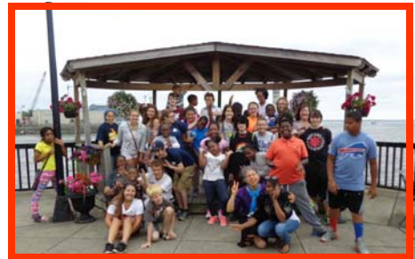
Campers at the Marina