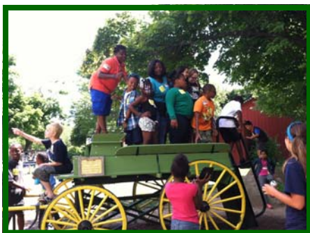
Visit to the Buffalo Zoo

All together, Camp Peaceprints is a vigorous exercise in Peace Messaging. We work to be the change we want to see, and to send the message that we can all leave peaceprints everywhere, as we reach out and create community. Camp Peaceprints provides the inspiration to love and care for each other more, and the tools to communicate that intention. The tears at the end of Camp and the relationships built say we made good progress toward that goal.