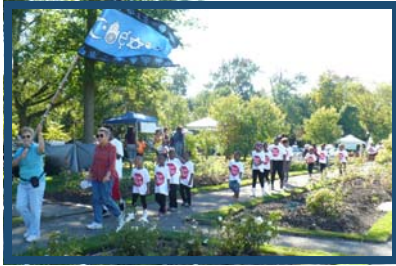
Rose Garden Peace Walk

In the dappled sunshine and refreshing breeze, the SSJ Sister Karen Klimczak Center for Nonviolence joined in a Peace and Nonviolence Festival in Delaware Park Rose Garden on Sunday, September 21 st . The festival was in solidarity with Campaign Nonviolence, an international effort to promote peace begun by the interdenominational organization Pace e Bene (“Peace and All Good”).