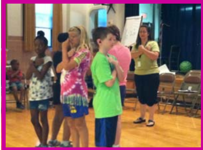
St. Mary's students sign "love"

Peace Messaging at St. Mary's School for the Deaf, 2253 Main Street in Buffalo, was the heart of Camp Peaceprints 2014! In our seventh year, we focused on communication, and got a real lesson in how the impulse to connect is a powerful force.