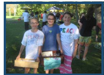
Girls wearing PEACE and LOVE shirts they made at the festival.