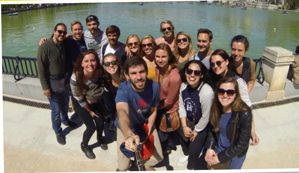
Interest Group, Madrid, 2016