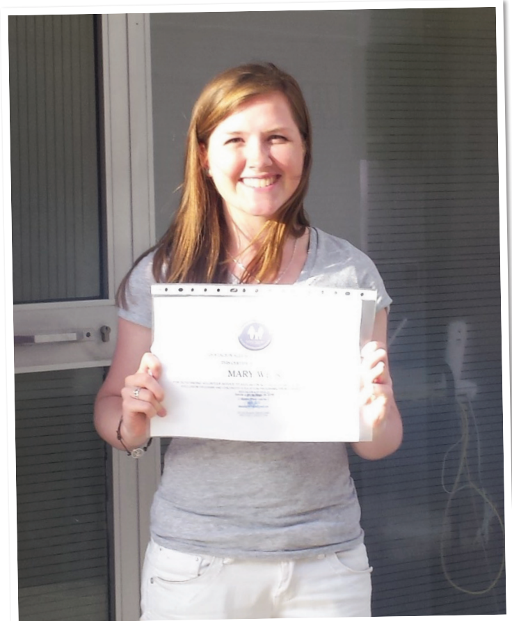
Volunteer Certificate from Asociación ALEF