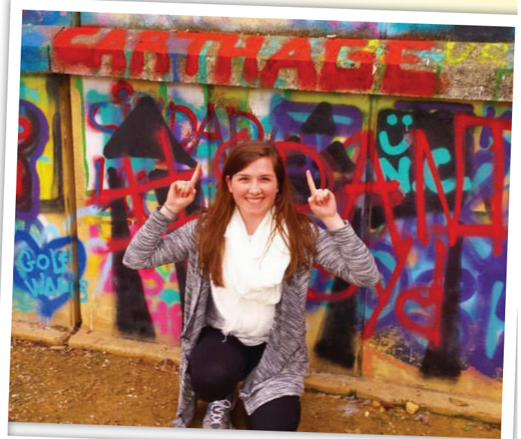
Sevilla, Spain 2016