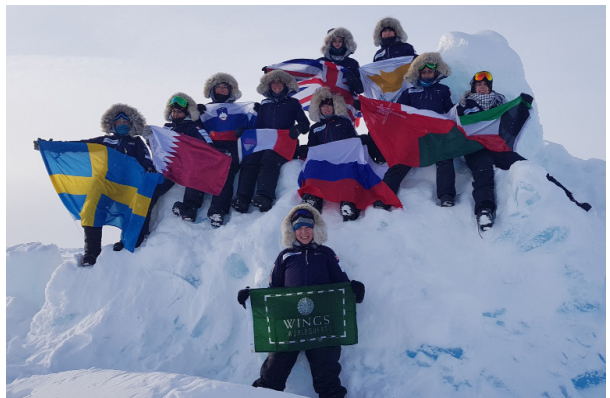
The Women's Euro-Arabian North Pole Expedition 2018 Team

The expedition involved skiing 80km in seven days across the shifting pack ice of the Arctic Ocean. The temperature fell as low as -38C while the team dragged all their equipment and supplies in sledges weighing 50 kg, slept in tents on the ice and faced both pressure ridges (barriers of