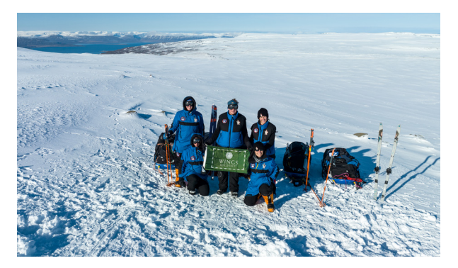
Felicity Aston and the B.I.G. Expedition Team with Flag #27. Drangajokull, Iceland

Driving to the end of a very rough coastal road, the expedition team accessed Drangajokull via Unadsdalur, a valley stretching 20km from the sea to the outer edge of the glacier. Skiing with equipment in sledges and camping on the ice, the team made a traverse of the glacier travelling from its southeast corner up to the summit of Jokullbunga (935m) and then maintaining the line of roughly