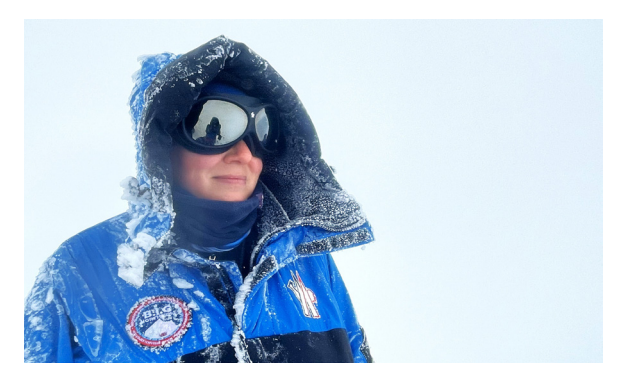
Felicity Aston, Drangajokull, Iceland.

of Durham. With the outwards traverse and science complete, it only remained for the expedition to travel back across the glacier from east to west. It was necessary to rendezvous with a vehicle pick-up on the western edge of the glacier due to the fact that the snow cover in the access valley (which had been minimal at the outset) was now gone!