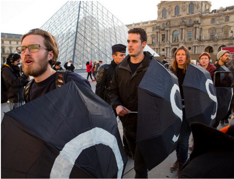
Protesters at the Louvre.

Beginning at noon today, hundreds of activists defied a ban on protest by surrounding the famed I.M. Pei-designed glass pyramid outside the museum. The event saw demonstrators dress in black and brandish umbrellas that spelled out the words "Fossil Free Culture." Others, dressed as angels bearing signs that read "Climate Justice: No Excuses," also joined the event.