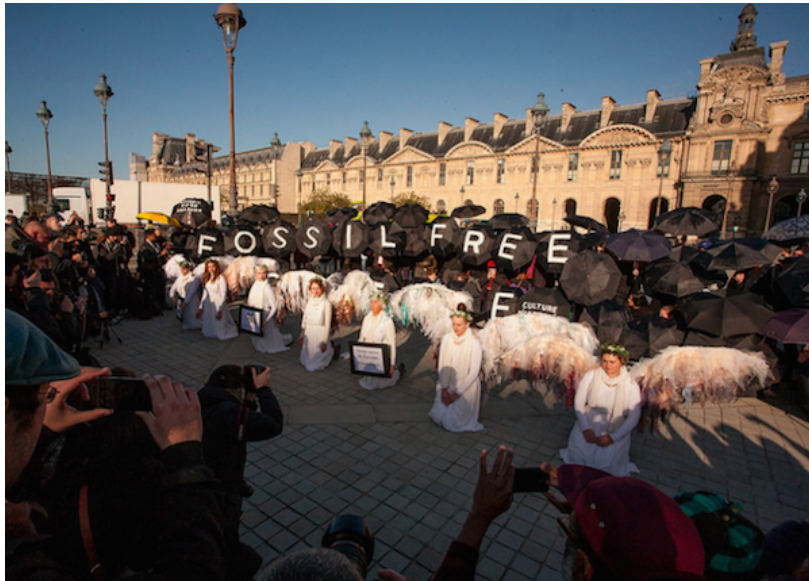
Activists protest in front of the Louvre in Paris during the Paris Climate Summit, calling on the museum to drop sponsors Eni and Total.

As the Paris Climate Summit draws towards a close, and with our collective futures hanging in the balance, an international coalition of artists and activists stepped things up today with twin actions, both inside and outside the Musée du Louvre. The goal of the protest: to demand that the world's most popular museum sever ties with French petroleum giants Total and Eni.