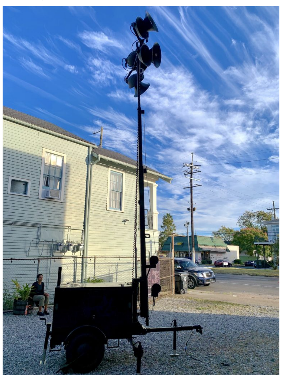
Battleground Beacon by Nari Ward.

For a mobile project parked at the University of New Orleans gallery, Nari Ward creates an audio collage, to be played from a mobile speaker system. Against a background of droning and Morse code, it <u>features</u> swirling fragments of speeches on the theme of racial justice, so that James Baldwin's voice alternates with the voice of Amanda Gorman, the young Harvard-educated poet made famous when she spoke at Joe Biden's inauguration.