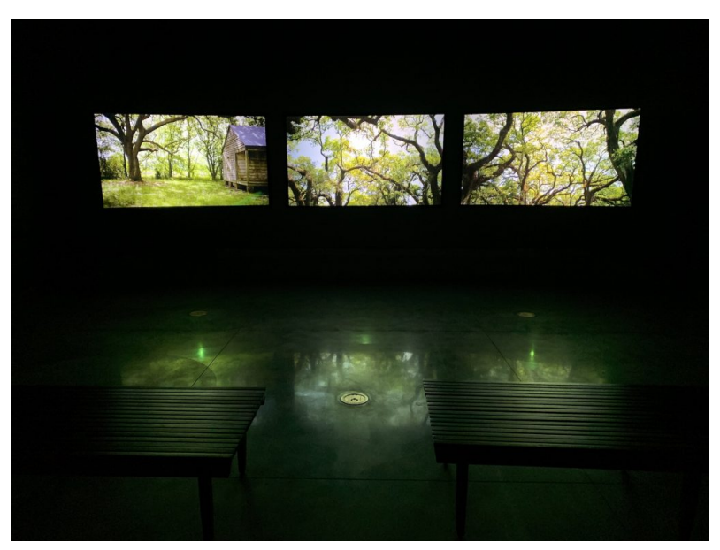
Video by Dawoud Bey at the Historic New Orleans Collection.

Some 80 percent of the artists in "Yesterday We Said Tomorrow" are Black, and the most persistent theme of the art in the show is the memorialization of Black history. At the Historic New Orleans collection, Dawoud Bey offers a video triptych that drifts across the remains of the most completely preserved slave plantation, trembling with portentous music.