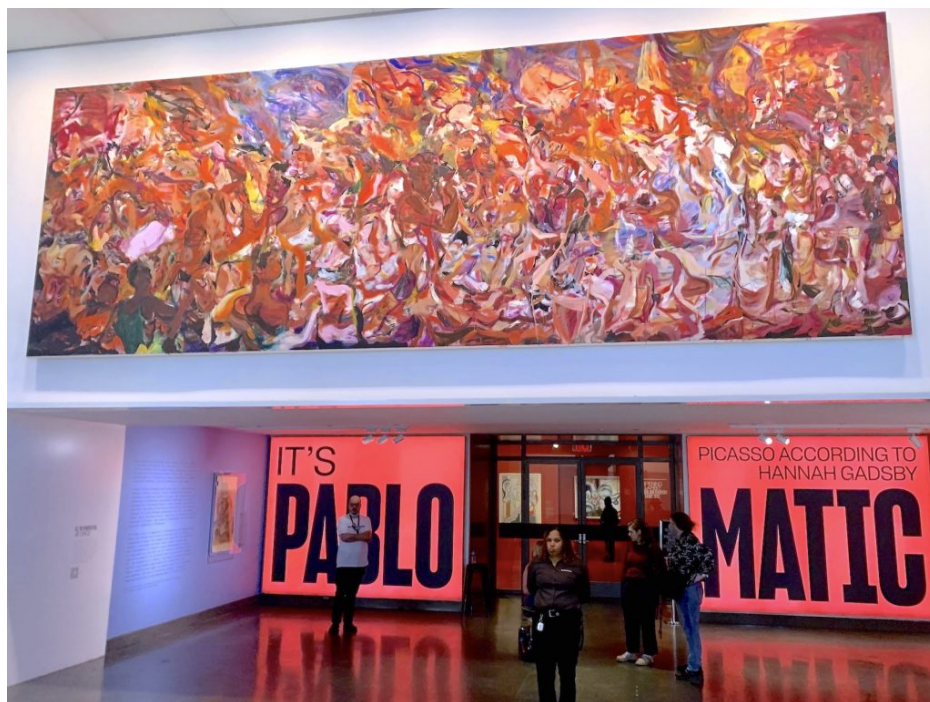
Entrance to “It’s Pablo-matic” at the Brooklyn Museum, with Cecily Brown, Triumph of the Vanities II (2018).

The disparity in reactions to Nanette versus reactions to “It’s Pablo-matic” might represent different things. It might suggest a change in the surrounding political and cultural moment—a “ vibe shift ,” if you will. Or it might stem from a change in where the takes are coming from, as we go from the general-interest audience of Netflix to the more specific audience of art—suddenly critics who always had doubts about Gadsby’s art history have their moment to speak. Or it might just be that the Brooklyn Museum bungles the show.