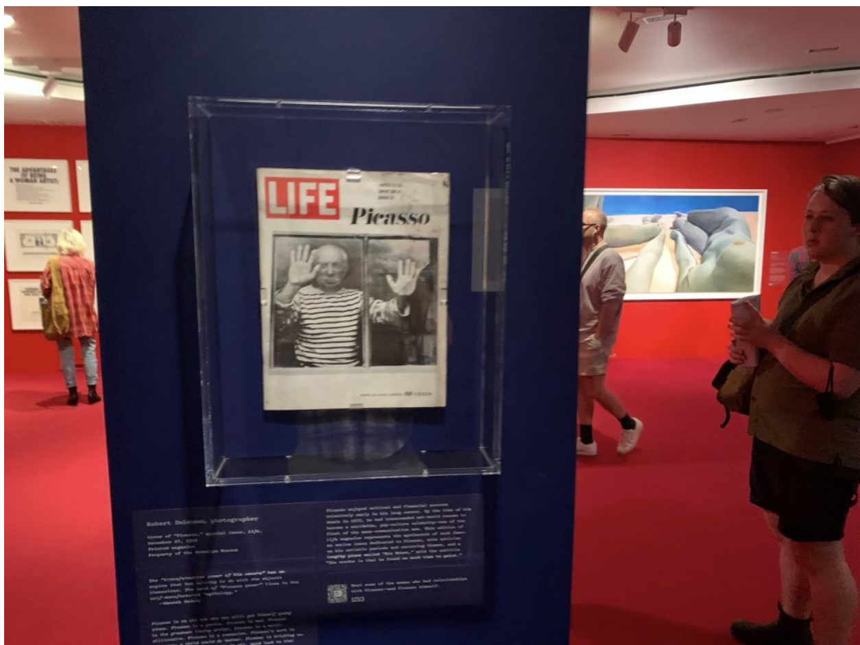
A 1968 issue of Life magazine featuring Pablo Picasso on view in “It’s Pablo-matic.”

Wall texts one gallery over remind viewers that legal age of consent in France at the time was 13, and quote Walter remembering the experience positively : “We would joke and laugh together all day, so happy with our secret, living a totally non-bourgeois life... you know what it is to be really in love? Well, who needs anything else then? We spent our time worrying about nothing, doing what every couple does when they’re in love.”