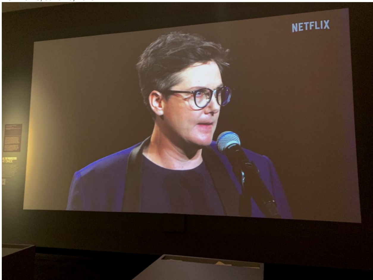
Video of Hannah Gadsby's Nanette (2018) playing in "It's Pablo-matic" at the Brooklyn Museum.

Hannah Gadsby's 2018 alt-comedy special for Netflix, Nanette , was critically beloved with an intensity that was rare for stand-up. The Australian comedian's hybrid of observational comedy, confessional narrative, and revisionist art history was a genuine event, within "the discourse," at least. Nanette even won a Peabody Award ,