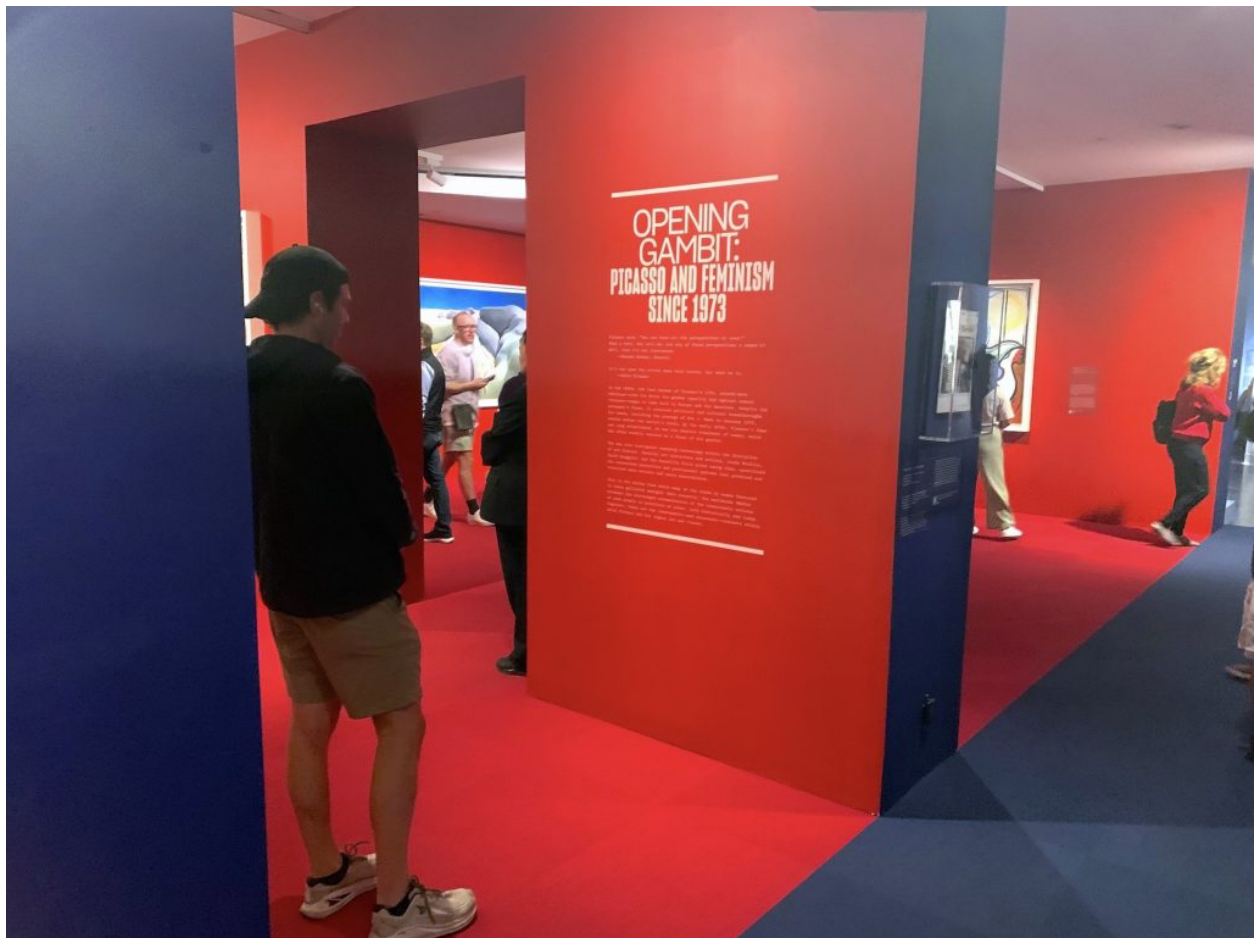
The opening gallery of “It’s Pablo-matic.”

“Bjork” can be seen as the self-immolating climax of the hare-brained early-2010s celebrity-art-media fusion—the time when a pre-#MeToo James Franco was showing his video art at the Clocktower, and Jay-Z was summoning celebs and artists together to Pace gallery to rap about his art collection (“I just want a Picasso, in my casa”—not his best work).