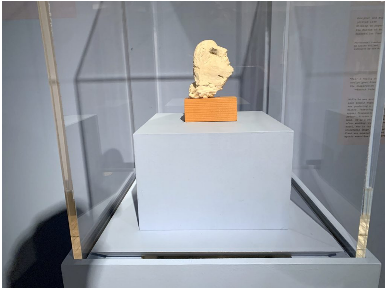
Pablo Picasso, The Crying Woman (1937).

point out that Picasso had no formal training in sculpture. It is hard to be impressed otherwise.”