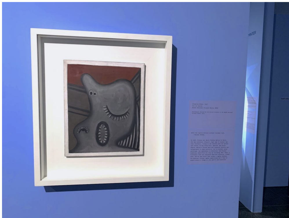
Pablo Picasso, Sleeping Woman (1927).

“It’s Pablo-matic” tries to adapt the spirit of Gadsby’s argument into an exhibition. But I have to say, after spending four hours in it, I started to suspect that what makes the show so strange and strained is that it is actually trying to work against Nanette ’s arguments—but without ever admitting that this is what is happening.