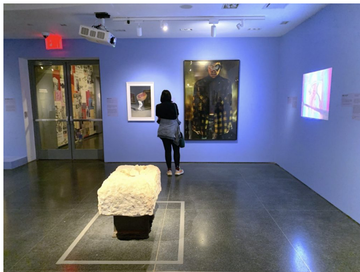
A gallery in “It’s Pablo-matic.”

Gilot writes the following at one point: “It wasn’t that I didn’t admire his greatness; it was, rather, that I didn’t enjoy seeing it cheapened by a kind of imperialism which I thought incompatible with true greatness.” That seems a fine approach: You can appreciate a lot about the art without worshipping the “tormented-genius man-ballsack” stuff.