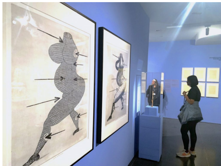
Louise Bourgeois, Tapestry (1994) and Tapestry (1995).

And then there’s Louise Bourgeois, grande dame of psycho-sexual sculpture, summoned from beyond the grave by the curators of “It’s Pablo-matic” to remember her reaction to a big Picasso retrospective at MoMA in 1939: “It was so beautiful, and it revealed such genius and such a collection of treasures that I did not pick up a paintbrush for a month.”