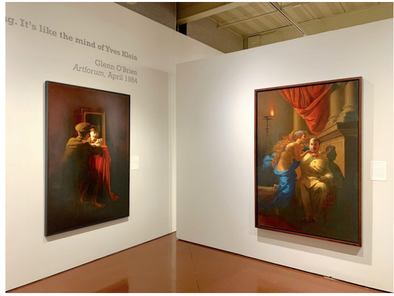
Paintings from Komar & Melamid's "Nostalgic Socialist Realism" series.

You see, for instance, fatherly tyrant Joseph Stalin being visited by a flowy-haired nude muse tracing the shadow of his profile on the wall. That's an allusion to the classical myth of the origin of art from Pliny, and the large canvas is called The Origins of Socialist Realism (1982-83).