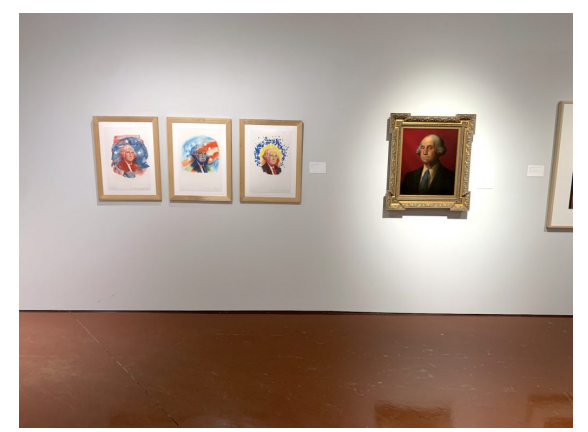
Works from Komar & Melamid's "American Dreams" series.

You get a feeling that some of the animating specificity of Komar & Melamid's work vanished as the Cold War context faded into the rear view. A <u>series</u> from 1999 making fun of the tropes of patriotic American art the way they had with "Nostalgic Socialist Realism" doesn't really land. Meanwhile, once the end of the Soviet Union made "dissident Russian artists" less of a hot topic, some of the interest in Komar & Melamid vanished as well.