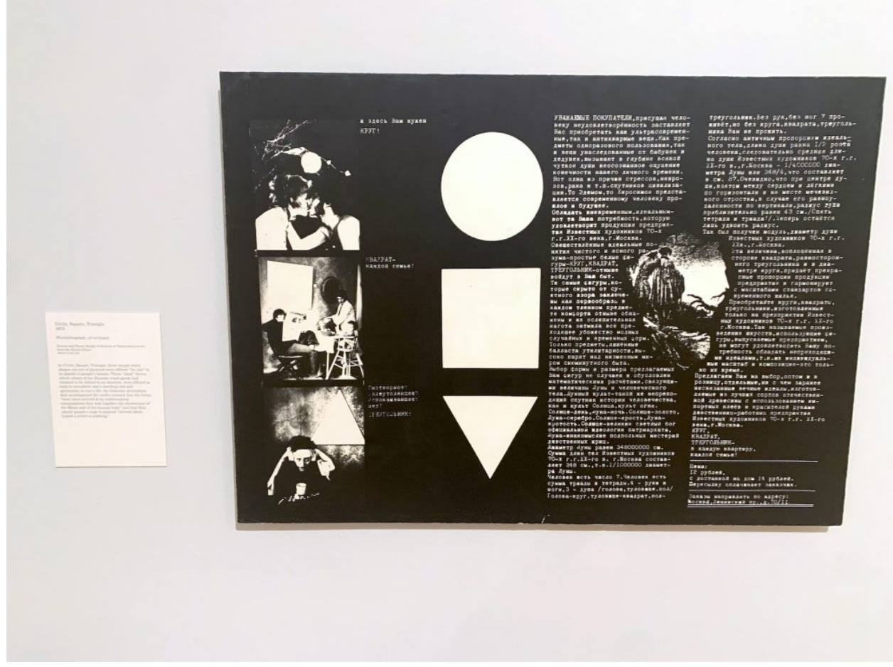
Komar & Melamid, Circle, Square, Triangle (1975).

Importantly, in their most generative early-'70s period, Komar & Melamid were mocking critics not just of official art in Moscow, but also—and maybe especially—of the handfuls of active non-conformist artists (most notably the recently passed <u>Ilya</u> <u>Kabakov</u>) who formed an alternative scene. What makes Komar & Melamid unique is just how deeply they imbibed and embodied the cynicism nurtured in the clunky, bureaucratic world of Breshnev-era Russia during the so-called <u>Era of Stagnation</u> cynicism that metastasized into a disidentification from any positive ideology for art at all.