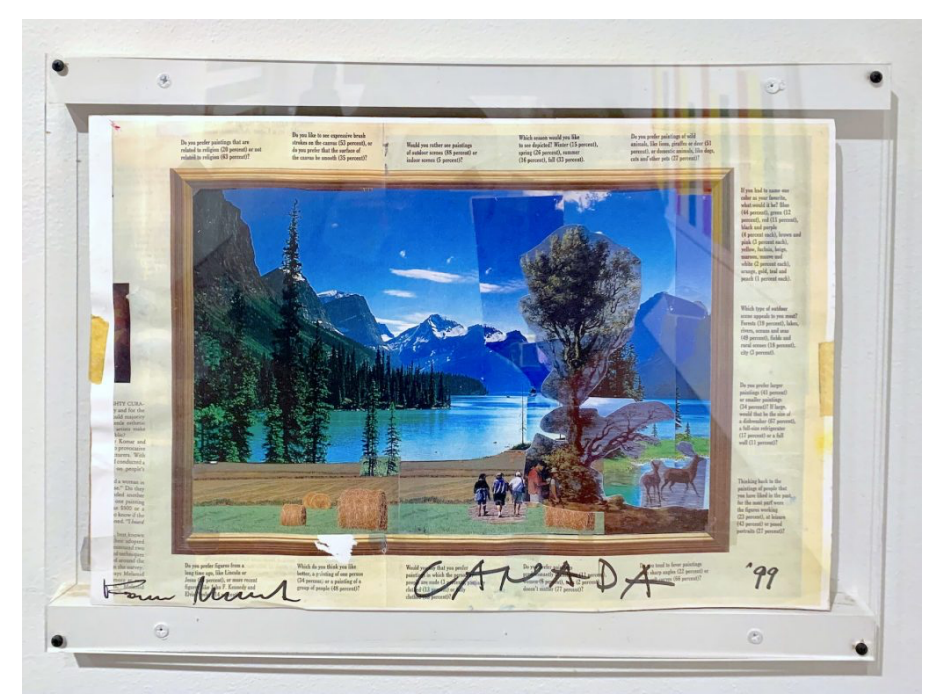
Study for Komar & Melamid, The People's Choice: Canada (1995-97).

Another example of the same nesting-doll irony: In the 1990s, Komar & Melamid would realize their most-widely known work, "The People's Choice." These were paintings based on a series of polls, where they gathered data about the most-liked and least-liked kinds of art from publics in various countries, and then created works that incorporated all the best and worst traits. (By this method, almost all countries end up preferring figurative art where a historical figure is near a body of water, and hating some form of geometric abstraction.)