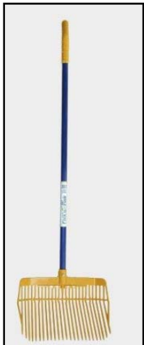
Manure forks with 5/16" tine spacing makes cleaning llama, alpaca, sheep and rabbit manure much easier than using a horse manure fork.