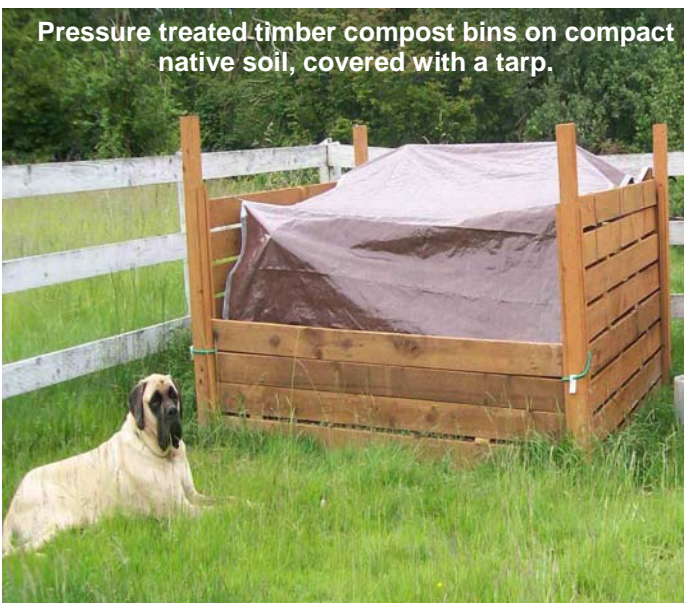
Pressure treated timber compost bins on compact native soil, covered with a tarp.