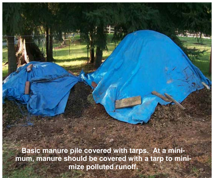
Basic manure pile covered with tarps. At a minimum, manure should be covered with a tarp to minimize polluted runoff.