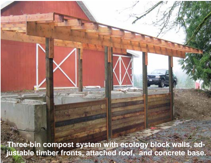
Three-bin compost system with ecology block walls, adjustable timber fronts, attached roof, and concrete base.