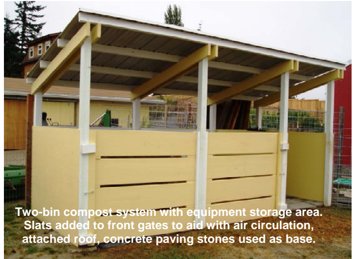
Two-bin compost system with equipment storage area. Slats added to front gates to aid with air circulation, attached roof, concrete paving stones used as base.