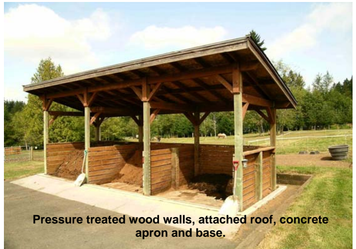
Pressure treated wood walls, attached roof, concrete apron and base.