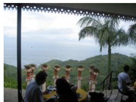
diner with the view