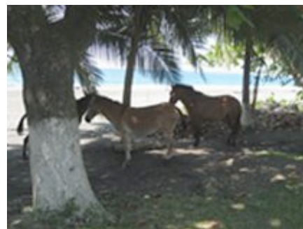
horsing around on the beach