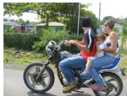
no helmet law here...