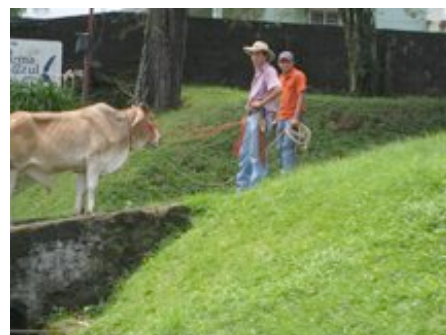
El Toro y Dos Amigos