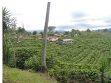
starbucks gets its coffee here