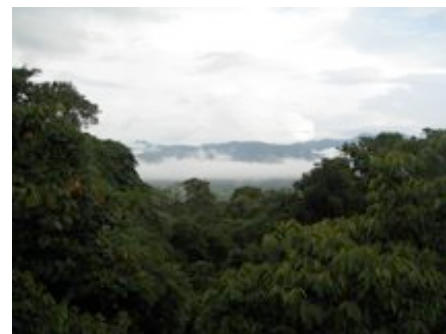
it's a jungle out there