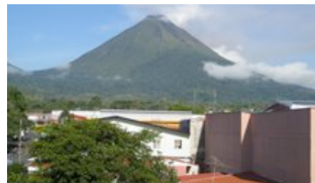
Active Arenal Volcano

It costs a lot less than you think to gain a foothold in this Costa Rican dream. Amazingly, prices at Los Cielos Estates start at only $50,000. I