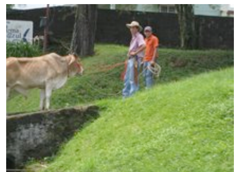
El Toro y Dos Amigos