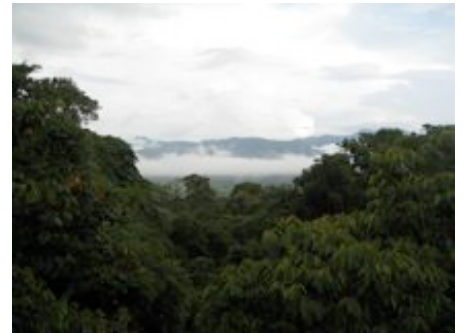
it's a jungle out there