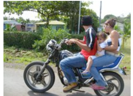
no helmet law here...