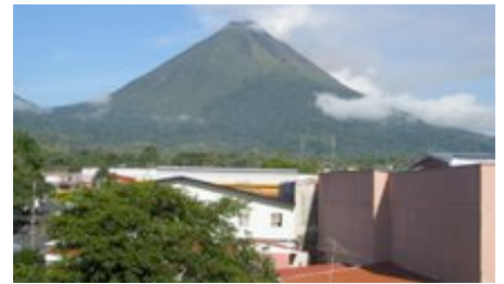
Active Arenal Volcano

This exclusive, private, gated community boasts scenic woods and sprawling creeks, surrounded by stunning views of majestic mountains. A private pathway leads from the property to a secluded private beach just a few hundred yards away. Los Cielos offers private horse stables on the property, so you can saddle up and explore it to your heart's content. And with hundreds of species of birds, sloths, monkeys, reptiles and countless additional exotic species right outside your door, there's plenty to see. Lot sizes start at one and a half acres, so no matter how much property you buy, you'll have plenty of room to stretch out. Stewart Title Insurance guarantees a clean property title. And when you're ready to make your dreams of owning a home in Costa Rica a reality, Los Cielos Estates is ready and willing to help with all of the details. They'll even assist you with selecting a builder, work with you on the design, and provide construction oversight if you need it. For added convenience, Los Cielos works with a California based architectural company that offers several tropical home plans to choose from. The best part? It costs a lot less than you think to gain a foothold in this Costa Rican dream. Amazingly, prices at Los Cielos Estates start at only $50,000. I