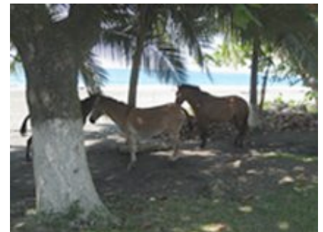
horsing around on the beach