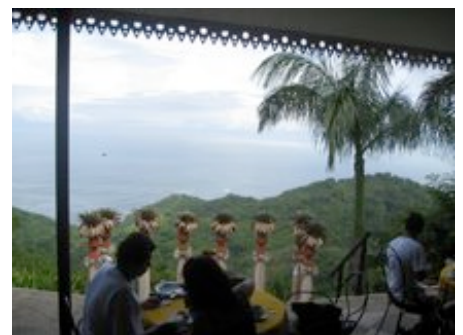
diner with the view