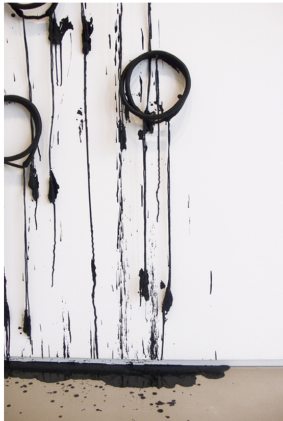
MOUNIR FATMI, Oil, Oil, Oil, Oil (detail), 2011, agals and black paint.