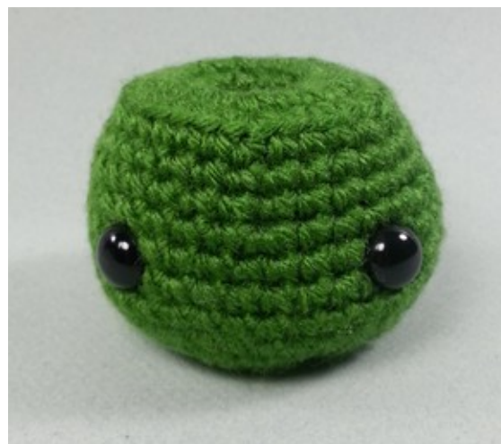
Attach eyes between r12 and r13, about 9 stitches apart.)