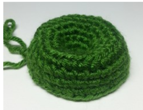
Dimple pushed in