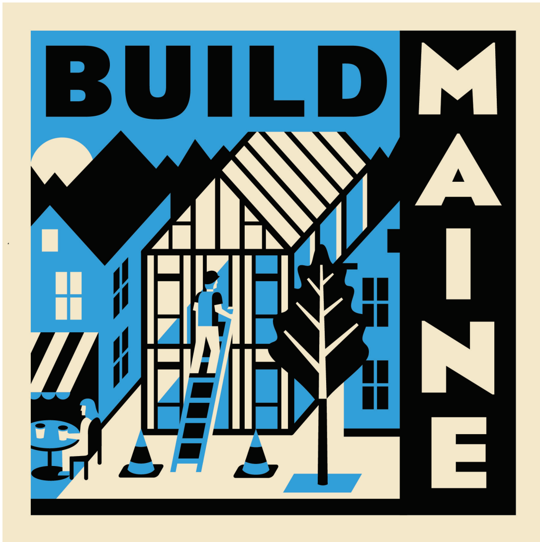
EXHIBIT & SPONSORSHIP OPPORTUNITIES

THE NEWSPAPER BUILDING 185 WATER STREET, SKOWHEGAN JUNE 7 + 8, 2023