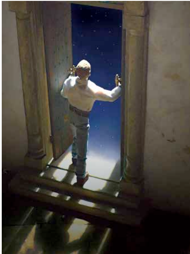
5 Greg Mort, The Watcher , oil on board, 36 x 29"