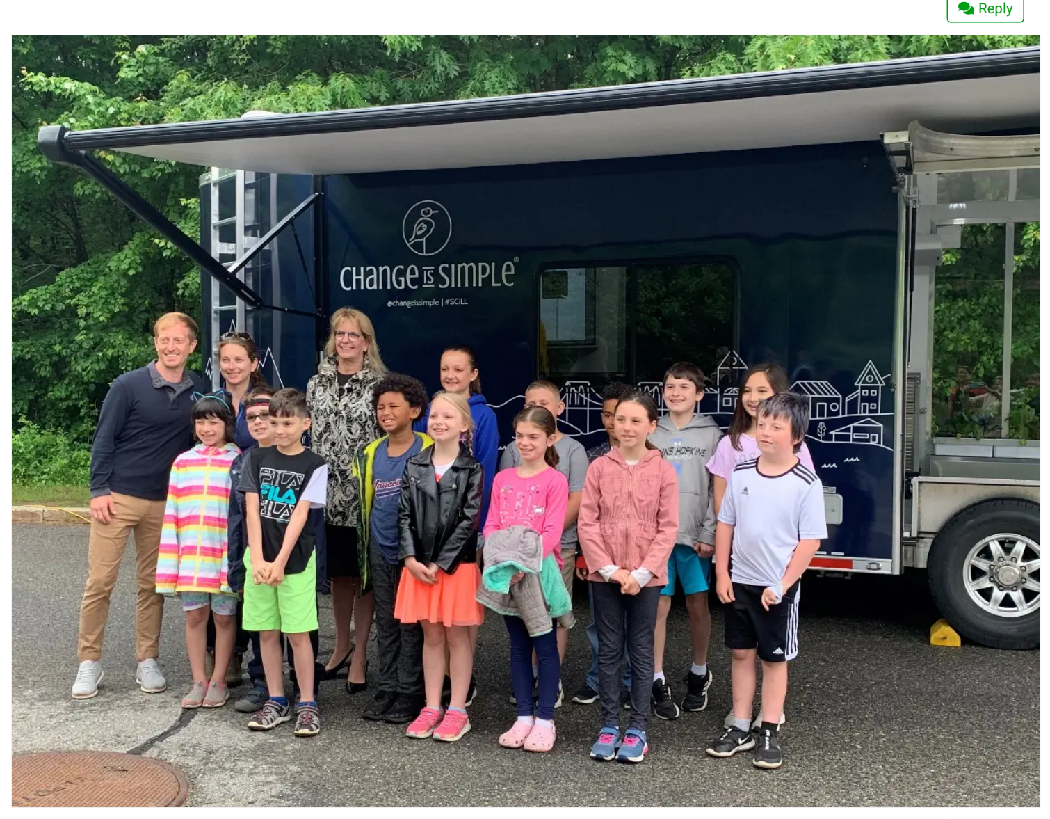
Hannah Elementary School students hang out outside of the 30-foot Change is Simple mobile learning lab during a visit to the school this month.

From lawn care to lawyers & anything in between, find local experts. Got it!