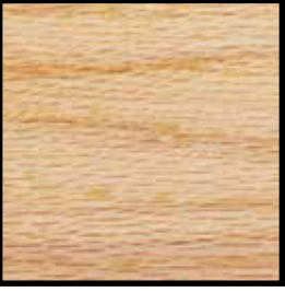
Natural Tint Base*