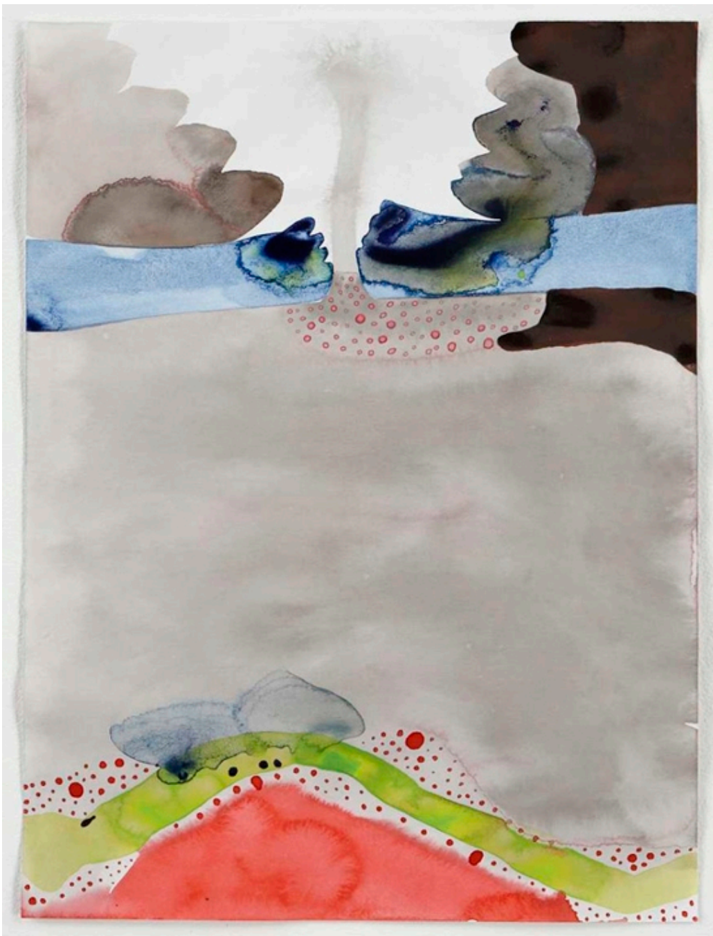
Eva Lundsager, Ascendosphere 42 , 2009, watercolor on paper, 12×9".