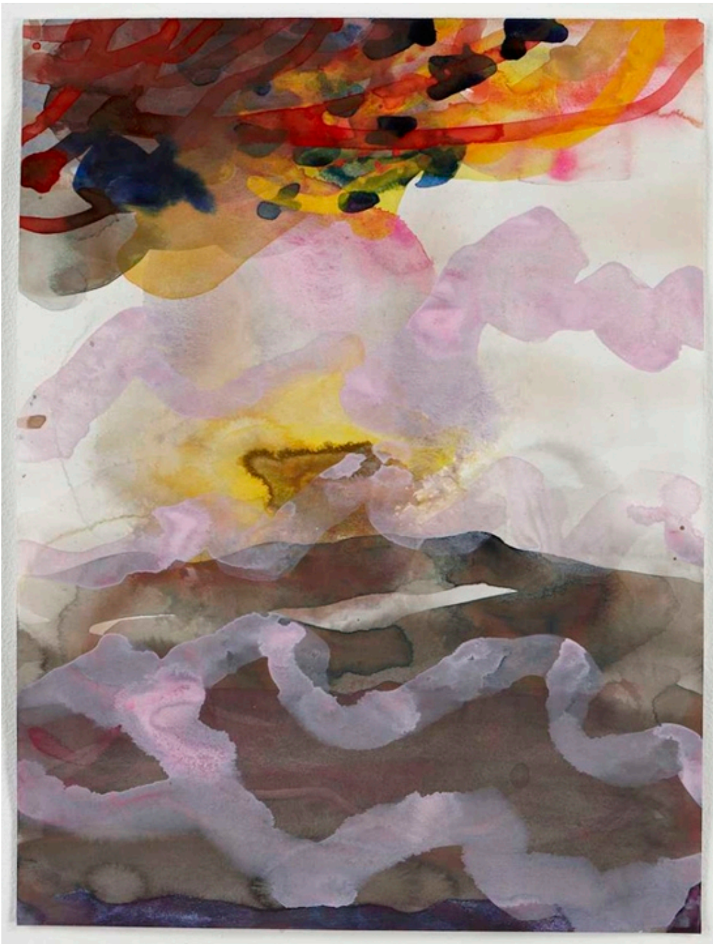
Eva Lundsager, Ascendosphere 26, 2009, watercolor on paper, 12×9".