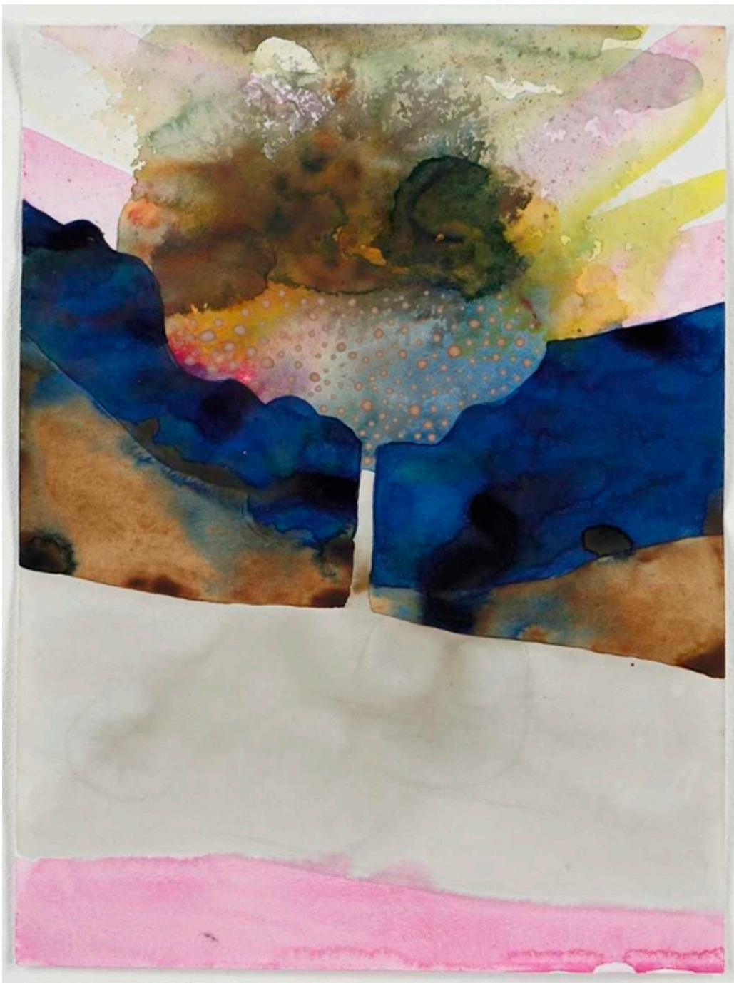
Ascendosphere 24, 2009, watercolor on paper, 12×9".

If you like this article, you might also like: