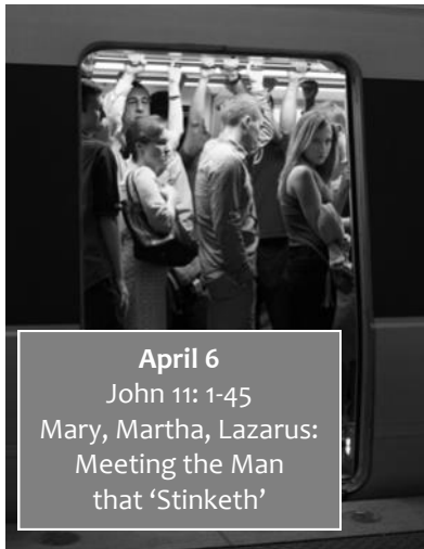
April 6 John 11: 1-45 Mary, Martha, Lazarus: Meeting the Man that 'Stinketh'