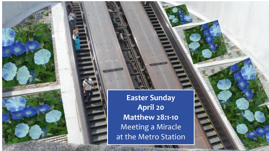
Easter Sunday April 20 Matthew 28:1-10 Meeting a Miracle at the Metro Station