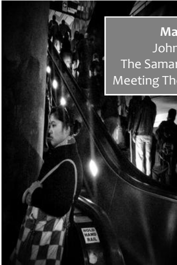
March 23 John 4: 5-42 The Samaritan Woman: Meeting The 'Other' in Me