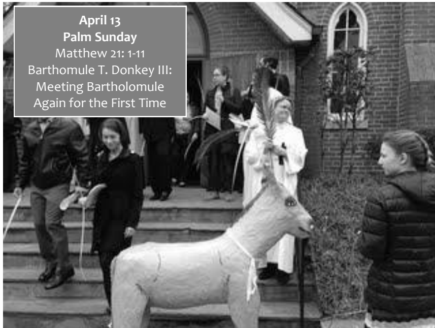
April 13 Palm Sunday Matthew 21: 1-11 Barthomule T. Donkey III: Meeting Bartholomule Again for the First Time