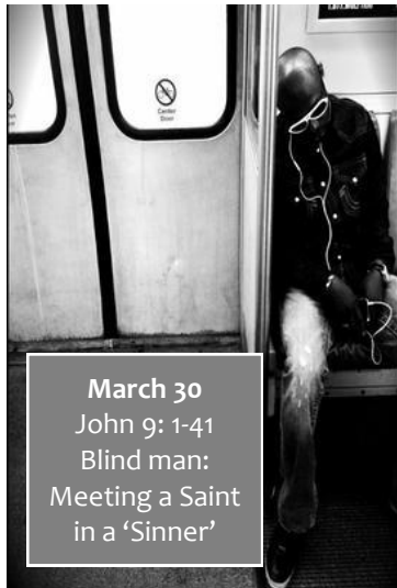
March 30 John 9: 1-41 Blind man: Meeting a Saint in a 'Sinner'