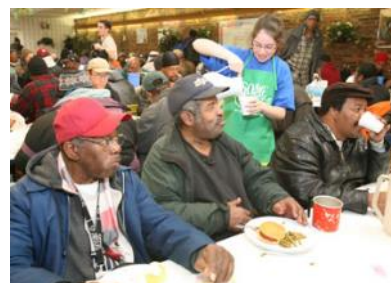
SOME relies on the support of volunteers and Provide-A-Meal groups to serve more than 800 meals to hungry people each day.