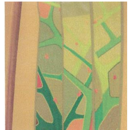
The green parament that decorates our Sanctuary during the seasons of Epiphany and Common Time reminds us of growth.

Centuries ago, before everybody had clocks and calendars, churches hung banners to let people know what time it was — time in the grand scheme of seasons. Those banners were called paraments and certain colors were developed for each season — purple for Advent, white for Easter, red for Pentecost. Over the years, other ways of marking days came along — calendars, bells on clocks, then computers and cell phones. While those new ways were coming into being, some of the old ways were tossed. Some Protestants, like our Congregational ancestors, shed their churches of the paraments as a way of wiping out what they saw as Roman Catholic influences and returning to sola scriptura . Then a funny thing happened. Amid the new whirls and lights and rings of modern time-keeping, some churches returned to the old ways. Banners, paraments, candles, robes — things our ancestors had shed — were reintroduced. People decided that intellect, austerity and modernity were not enough to speak to the full human. We need color, beauty and symbolism.