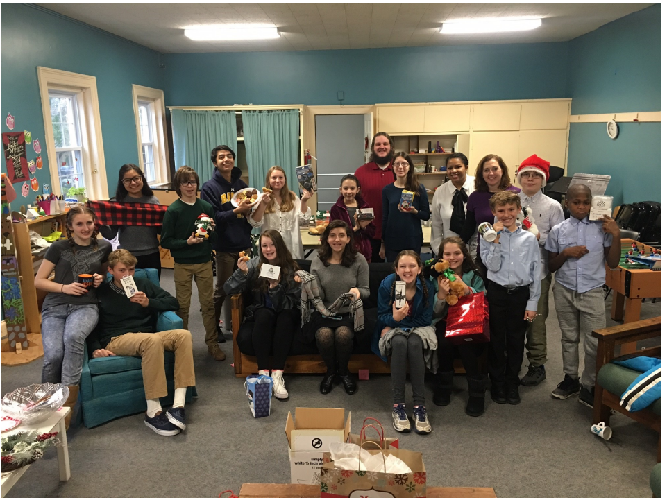
2016 Youth Christmas Party