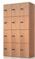
Wooden swing door furniture

The Design Line - featuring a metal cover and a knob in 4 standard finishes (polish black, white, satin silver and polish silver) - is the 10 Series top version, matching the practical efficiency of Combilocks range with the intrinsic elegance of metal: the right solution for the enviroments and furniture that excel in quality details. Exclusive soft-touch finishes and customized colors are available for contracts, on request.