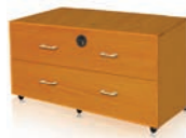
Wooden filing cabinets