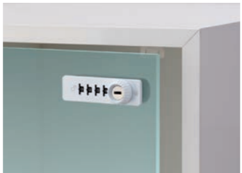
for the application on GLASS

The wide range of combination locks (10 Series) by Serrature Meroni is the solution to securely and easily close cabinets and lockers in gym changing rooms and in SPAs, in public buildings, in schools and hospitals: for any structure where a combination lock is an added value in terms of service and in terms of convenience, since keys or padlocks are not necessary. Moreover, the 10 Series combination locks are suitable for any need and are the solution for any piece of furniture of any material.