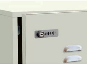
for the application on METAL

Serrature Meroni presents the new 10 Series: a complete range of combination locks for any type of furniture.