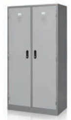
Metal swing & sliding doors furniture