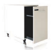
Metal filing cabinets