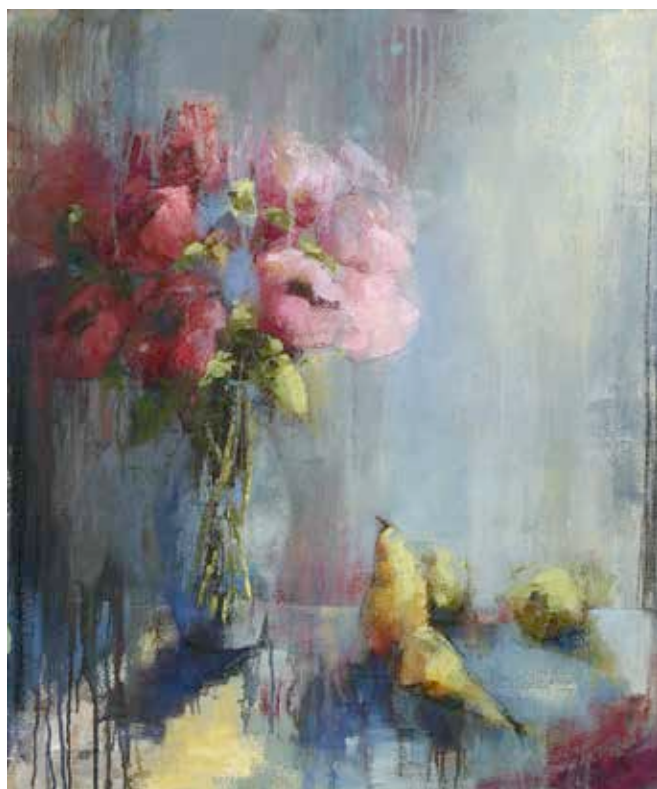
3 Serendipity, oil, 36 x 24"