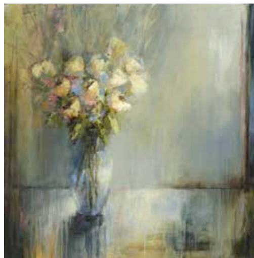
1 Joyful Roses, oil, 50 x 50"