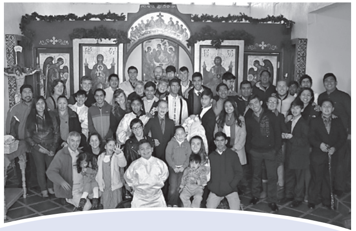
Everyone gathered together for a big group photo after Divine Liturgy on Holy Nativity (Christmas morning).

We are very blessed to have been awarded a generous $10,000 grant by The Order of St. Ignatius of Antioch. This 2015 grant helped to supplement the funding of our boys' education and tutoring program as well as the replacement of our aging orphanage well-pump. We are immensely thankful to The Order for generously partnering with us year after year in our effort to care for the poor and orphaned of Mexico.