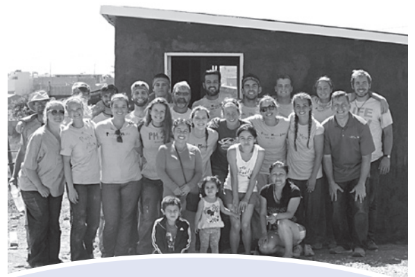
The 20 th house built in 2015, by St. Athanasius, St. Nicholas, and SS. Peter & Paul Orthodox Churches.

Thanks to Leadership 100, we have been given the opportunity to share our Home Building Program, and we are truly grateful for its trust in our ministry of hope.