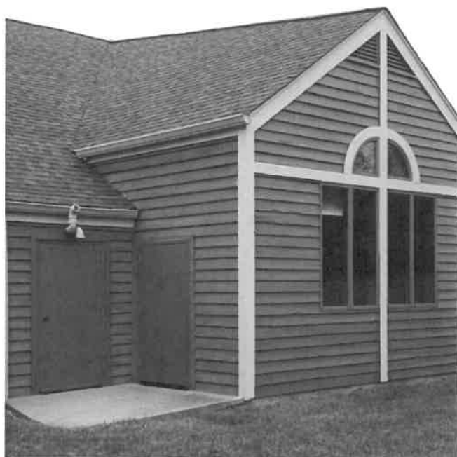
Figure 1 Original Siding

Siding: Our major project for 2016 was the siding replacement of the church. While this was an expensive endeavor, it should reduce our maintenance expense for paint and heating. We installed a high grade of insulated siding over all of the existing siding around the church. The siding project included metal coating all external wood. This work was done by Midwest Construction 636.386.8050 ( http://trustmcgroofing.com ). Dustin Greene was my contact at MCG and he worked on getting just what we wanted at the lowest price. Several people in our subdivision had used MCG for roofing projects and they had done some roof repair at Woodlawn in the past. The work crew was very good and worked hard to perform good work and stay out of the way of church activities. We also put address numbers on the rear of the church at the request of the Fire Department. I have written a recommendation for MCG on their web site and Angie's list.