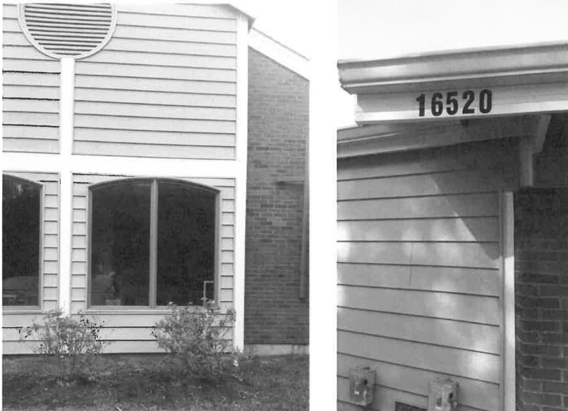
Figure 2: Completed Work