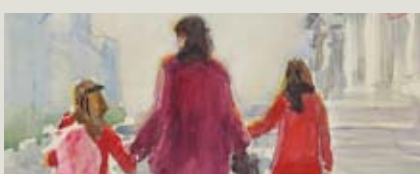
CAROLINE GRAHAM Watercolor (W-1) Watercolor (W-2)