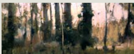
STEVE PARKER Landscape into Art (P-7) Indoor / Outdoor Landscape (P-12)