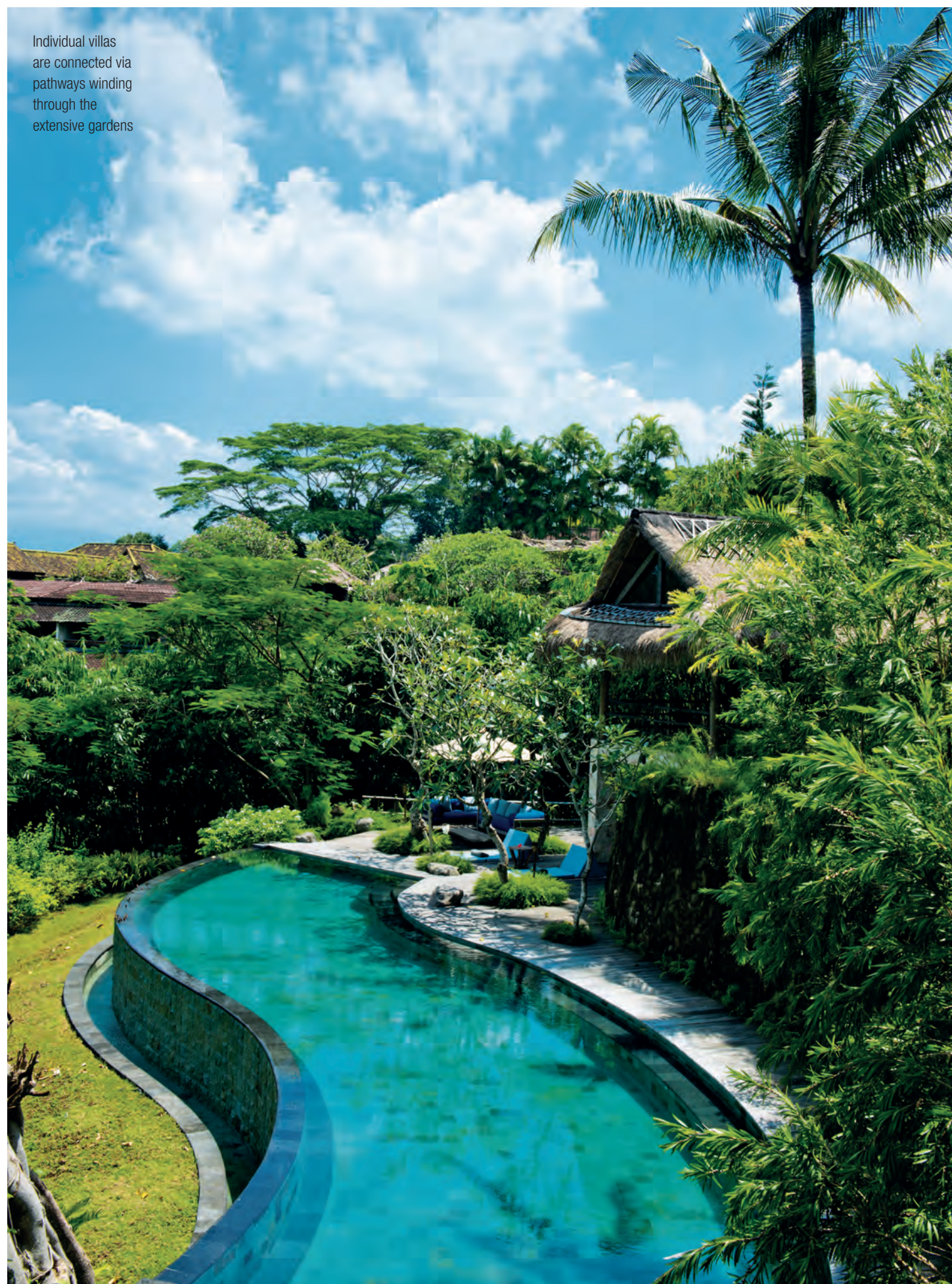
BY ESTER HILMARDOTTIR PRODUCTION AND STYLING KISSA CASTAÑEDA

Individual villas are connected via pathways winding through the extensive gardens