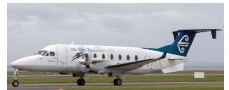
Taupo Airport 35 minutes