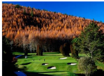
6 Golf courses 5-40 minutes away