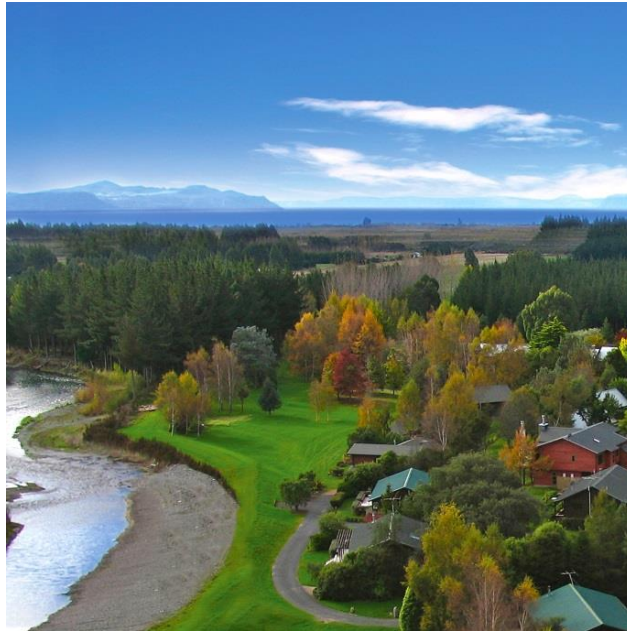
Tongariro Lodge – the gateway to fun