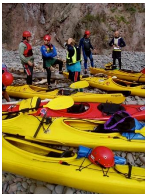
Kayaking – 10 minutes