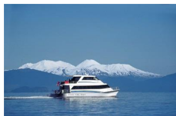
The lake – 5 minutes