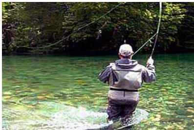
Fly fishing – a cast away