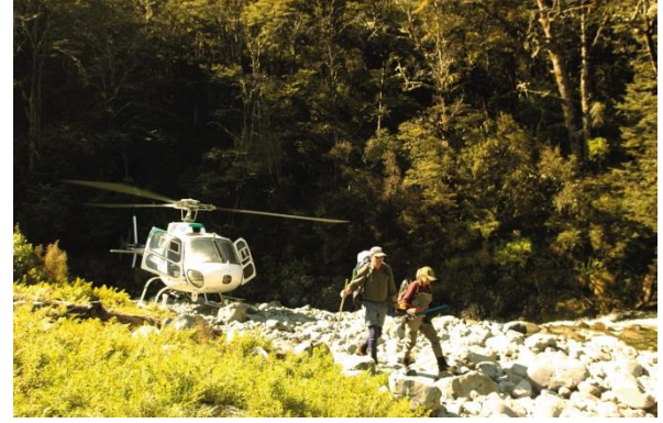
Helipad 0 minutes However far you wish to go