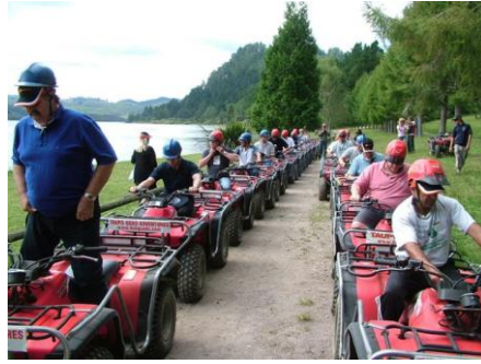
Quad bikes 10 minutes