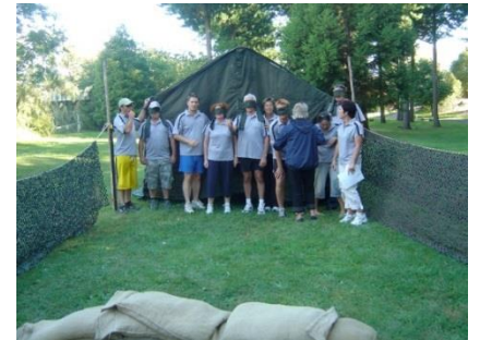
Team building 0 minutes