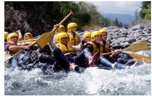
White water rafting 15 minutes