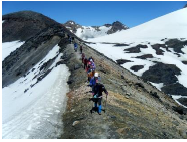
Ruapehu Crater walk 40 minutes