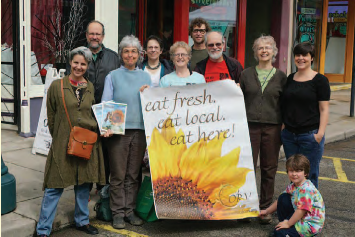
It takes a village to complete a CORV guide

Welcome to the eighth annual edition of the CORV Local Food Guide. It takes a village to produce this guide so gratitude to all. There's a lot to show and tell. Read about winter eating, CSAs, seeds, market managers at work, local brewing, and distribution with more on our website. See the map of the area we cover, the various lists of resources in this region, and a flow chart of the food system.