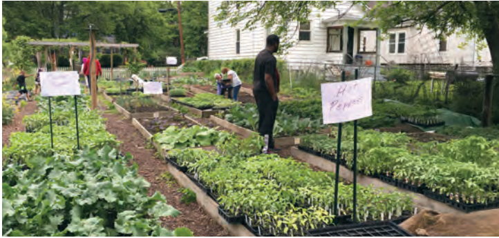
Madisonville Garden Market (top left), Lighthouse Community School Garden (top right), Plant Giveaway (Bottom)

MADISONVILLE is growing food access. Lighthouse Community School (LCS) is a charter school run by Lighthouse Youth Services that now has an agriculture program. With the support and encouragement of Sidestreams Foundation (SF), they have developed an Urban Agriculture program over the past six years. It's complete with a parking lot garden, a previously vacant lot garden, chickens, and an aquaponics system. Three years ago, the Madisonville Garden Market was subsequently started as a job training program for youth from LCS to sell the vegetables and eggs they help produce.