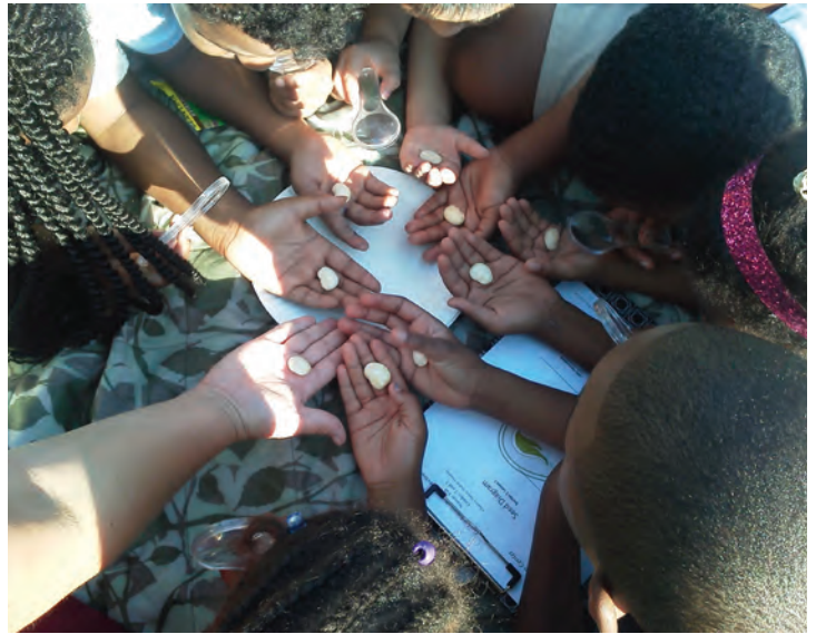
Civic Garden Center