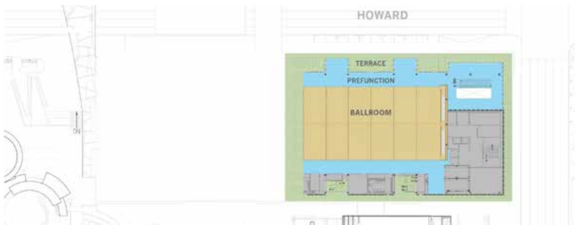
4TH LEVEL PLAN