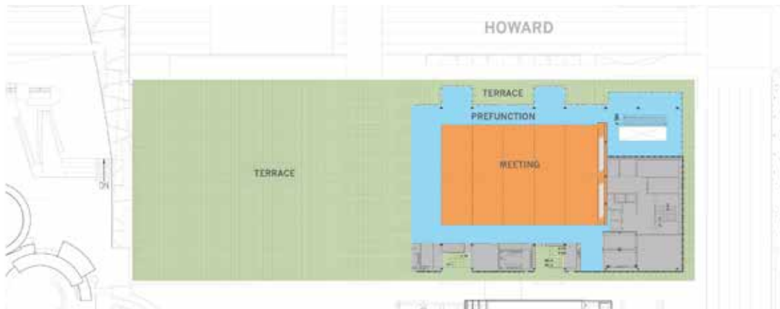
3RD LEVEL PLAN