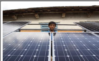
24 Panel Solar Array