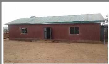
New Study Hall

Nazerratti Center May 2016 Tanzania 42 Children Impacted $17,260