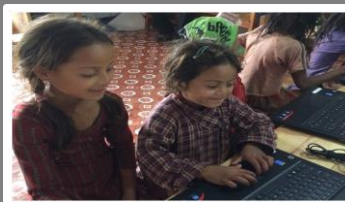
Solar powered computer lab