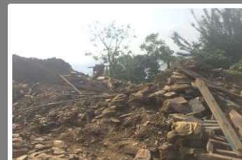
School site post 2015 Earthquake

In addition, Orphans to Ambassadors provided 20 computers powered by 24 solar panels and 16 industrial strength batteries to provide computer literacy programs for all 500 students attending the school.