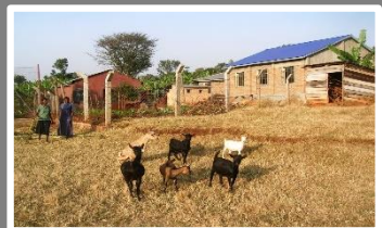
Livestock Grazing Land

Geraldina School May 2015 40 Children Impacted $1,700